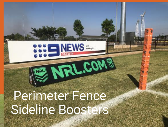
Perimeter Fence Sideline Boosters

NRL NT Game Day & Event Resources examples primarily based on partnership investment.