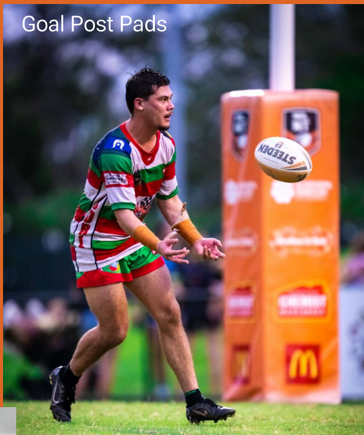
Goal Post Pads