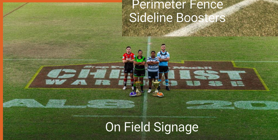
On Field Signage