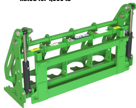
CT3RRGJD1 - JD Green