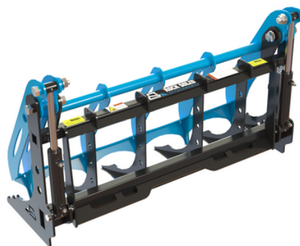
CT3RRG - Rock Solid Blue + Black