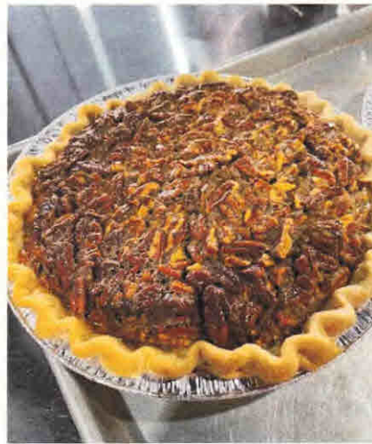
The Messy Bun