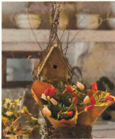
Beehind Tyme Farm & Garden