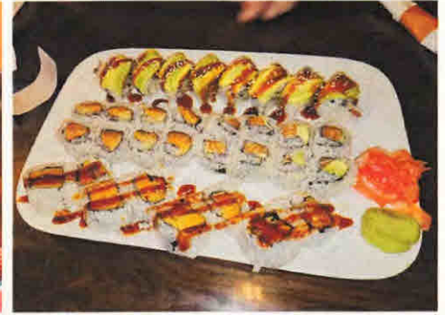
Yamato Japanese Steakhouse