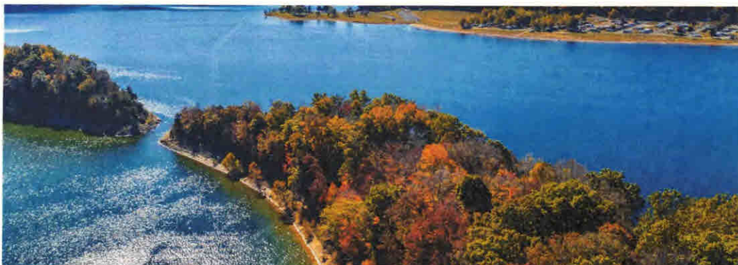
Green River Lake State Park

Pack a picnic from downtown or grab takeout to enjoy by the water. The rolling hills and sparkling lake create the perfect spring backdrop.