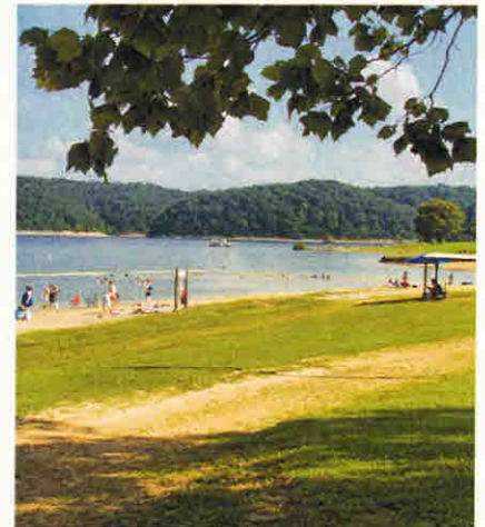
Green River Lake State Park