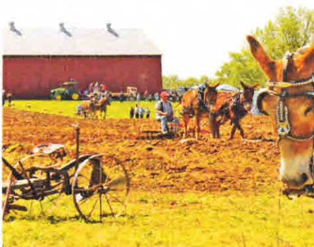
Homeplace on Green River

Both experiences offer a meaningful glimpse into our community's roots.