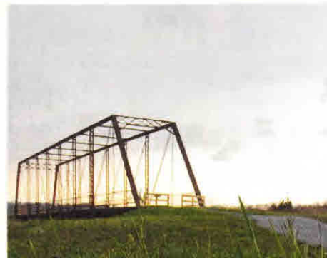
Tebb Bend Battlefield