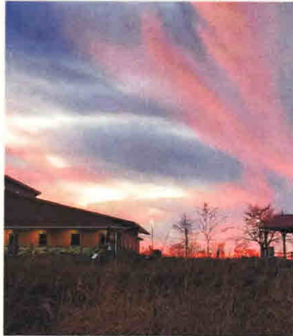
Clay Hill Memorial Forest