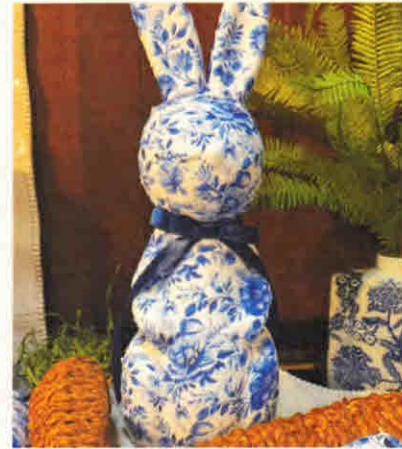
The White Orchid