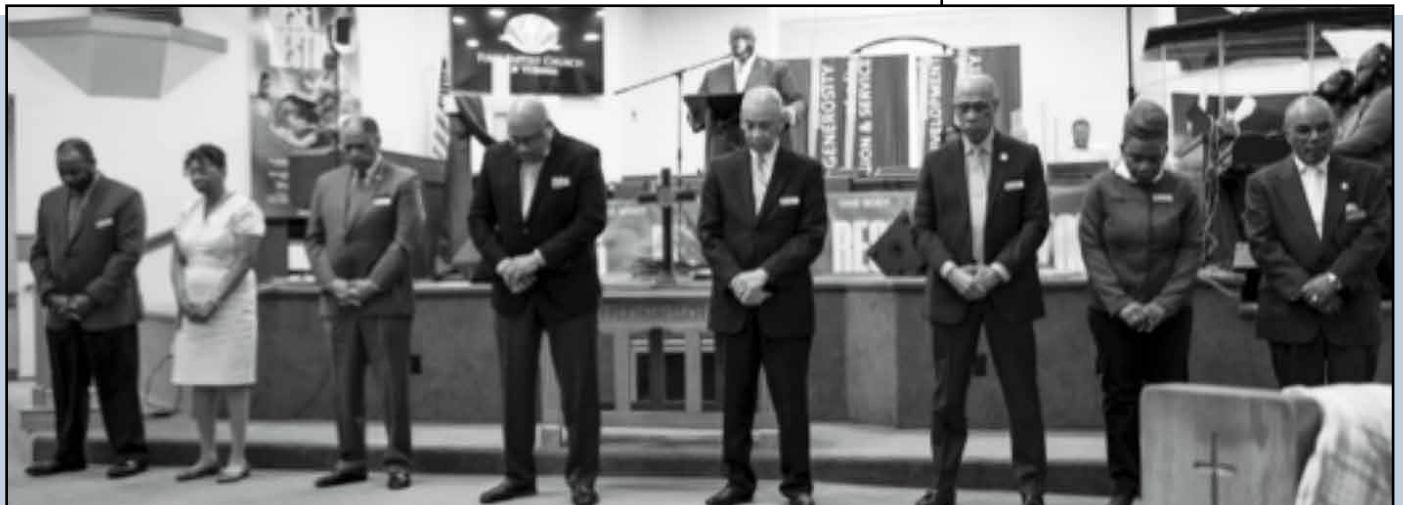
Together we are stronger: The FBCV Deacons standing together