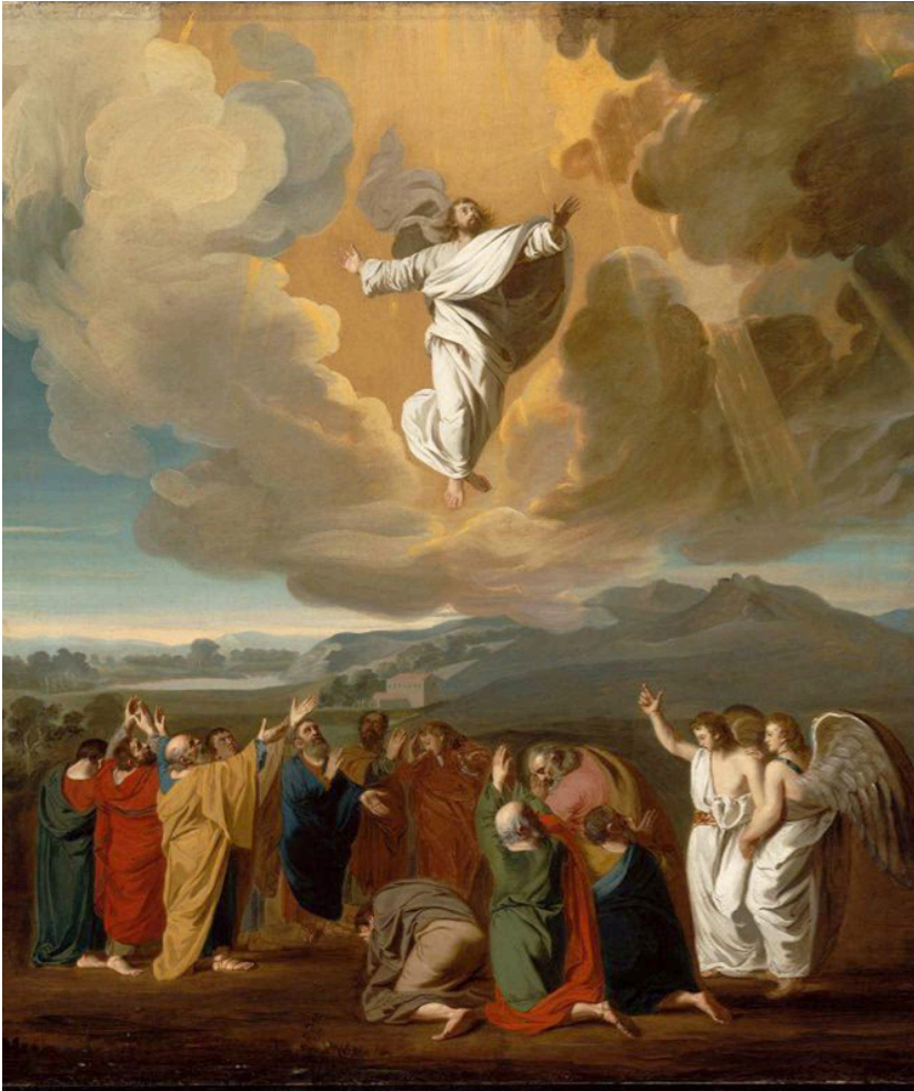
The Ascension : John Singleton Copley (1738-1815)

"If you have risen with Christ, set your hearts on the things that are above where Christ is, seated at the right hand of God. Seek the things that are above, not the things that are on earth"