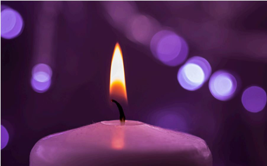
The Prophecy Candle : HOPE