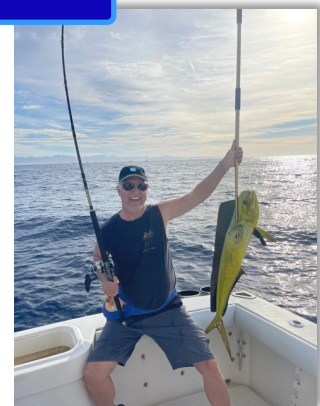
Dorado Catch in Cabo

Our Mission is to provide the very Best service possible to our clients and to meet new friends who are looking for assistance in obtaining a Medicare Plan. It is our Joy to be your Agent/Advisor. We appreciate your referrals to those who are turning 65 or are new to Medicare. We also provide assistance to those who need help enrolling into Medicare.