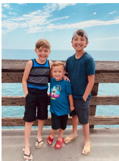
Being a Papa is Awesome!