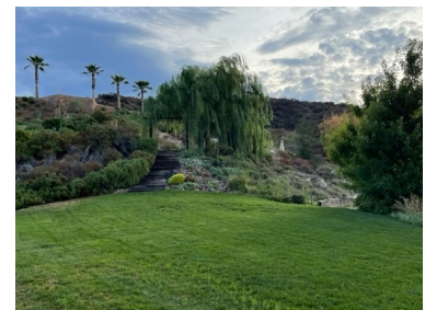
Litchfield Hills Wedding Venue