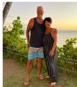
Aloha From Hawaii