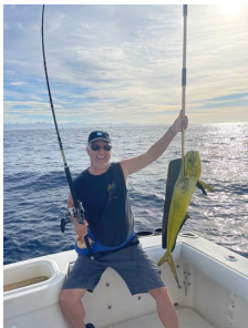
Big Fish Catch - Cabo