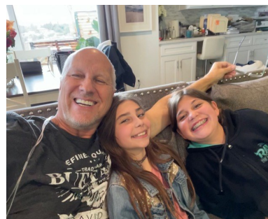
Papa with his girls