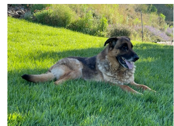
King doing his thing

Visit our website at: www.litchfieldins.com