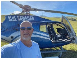
Keeping an eye out for Elvis