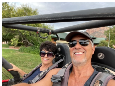
Touring Zion National Park