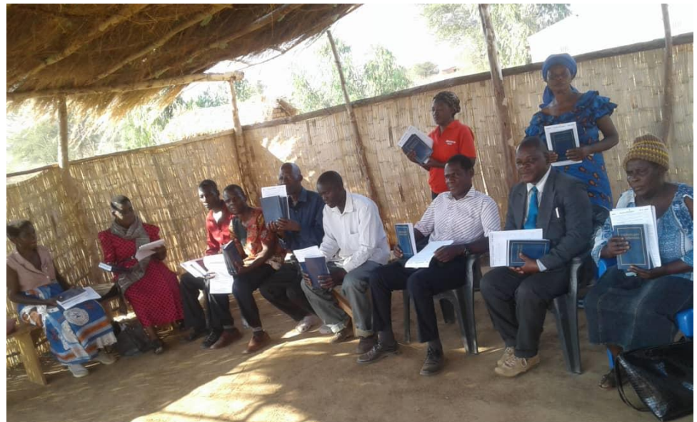
Photo below: Distribution of the new TBS Chichewa NT at a church in Malawi.

These grants were sent to Africa and Asia at the request of the Free Grace Evangelistic Association, and they were distributed through FGEA representatives and contacts. The Bible Spreading Union has also financially supported the purchase of French Bibles for Ivory Coast. These represent a very significant assistance to the work of FGEA. The Association has committed significant funding to the distribution and organisation of meetings, as many of the locations where Bibles are most needed are those places that are remote from big cities.