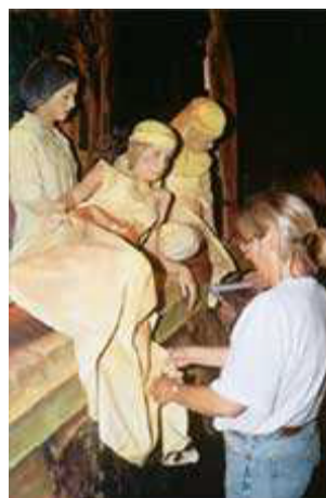
What goes on Back stage.