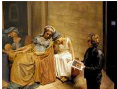
One of the many works of art depicted at the Pageant in past years.