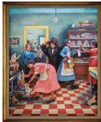
Imagine this performed live with the help of great lighting!