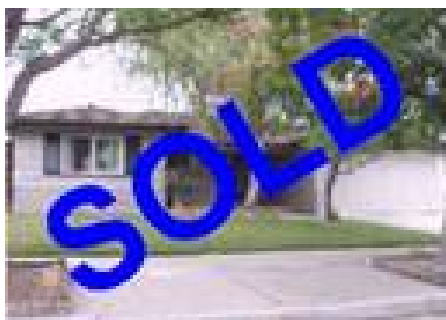
If you are working with another Real Estate Professional, Please disregard this notice. Copyright 2026