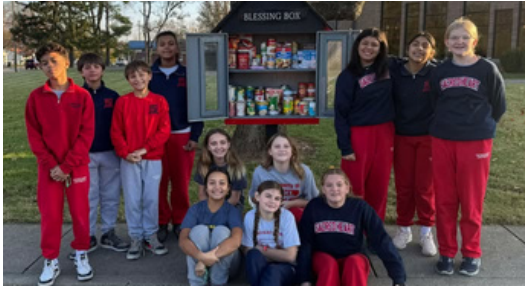
Thank you Sixth Grade for filling the Blessing Box in November.