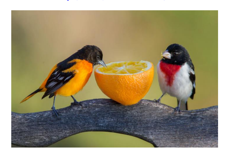
SCC Audubon Field Trip