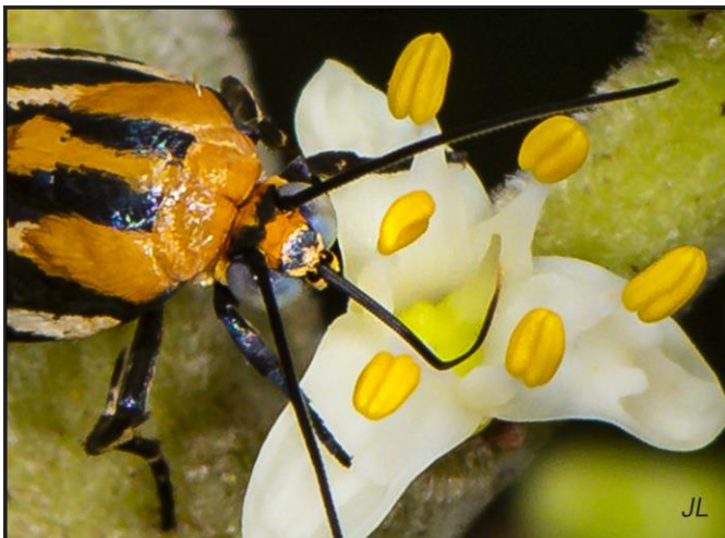
A butterfly or moth's tongue is not at all like a straw!

I noticed a touch of fall in the air this morning. While the temperature was 76 degrees, it was not oppressive; a gentle northerly breeze was refreshing. This is a sign of things to come! Maybe tomorrow morning you will look out your window and see little brown birds with yellow under their tail - palm warblers - chasing insects in your backyard.