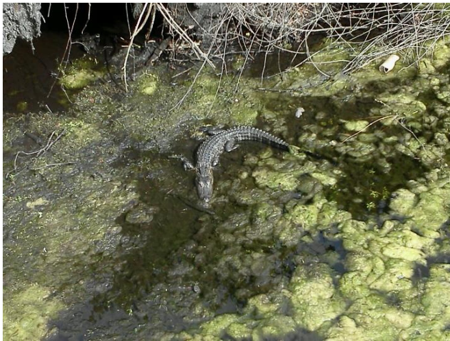
Sawgrass Lake Park

Please contact me at (813)-469-3994 or email at rjw1434@yahoo.com , to sign up for these trips..