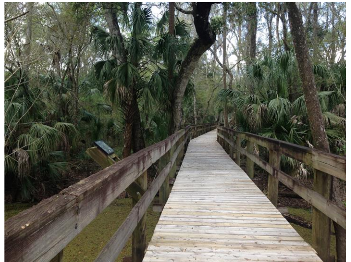
Morris Bridge Park