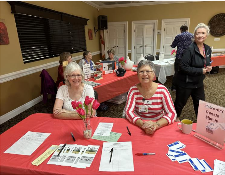
February 4 th Meeting Check In