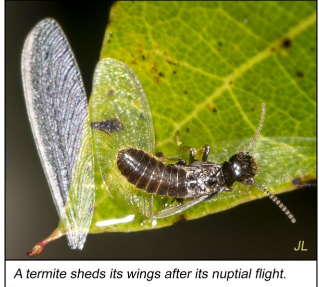
A termite sheds its wings after its nuptial flight.

Of course, we do not want these wood munchers in our houses as they do an estimated billion dollars worth of damage every year. But we DO want them in our natural areas! Like vultures, fly larvae, and dung beetles, they are Nature’s clean up and recycling crew. They eat not just dead wood, but also the other woodland detritus—leaves, stems and even dung. Because they return nutrients to the soil and are food for some mammals and birds, they are an essential element of healthy ecosystems.