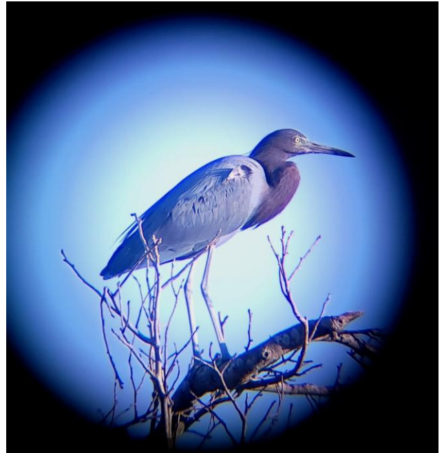
Little Blue Heron on pond in Kings Point