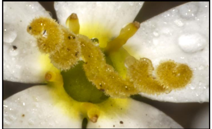
Two phases of the Shortleaf Rose-gentian flower: male, top; female below.