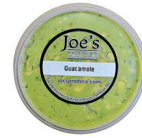
JOE'S FRESH GUACAMOLE $5.99/EA.