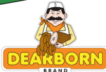
DEARBORN BRAND DEARBORN BAVARIAN HAM $5.49/LB.