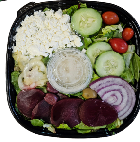
WEEKLY SPECIAL GREEK SALAD $7.99/8 OZ. | $10.99/16 OZ.