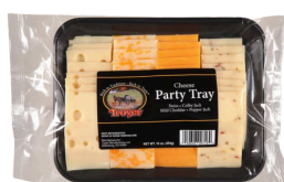
TROYER CHEESE PARTY TRAY $9.99/EA.