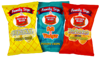
BETTER-MADE POTATO CHIPS FAMILY-SIZE 2/$7