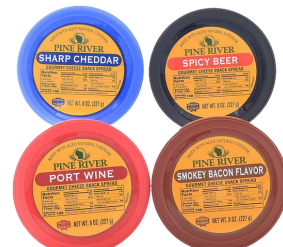
PINE RIVER CHEESE SPREAD ALL VARIETIES $5.69/EA.