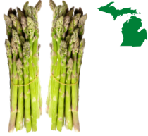
MICHIGAN ASPARAGUS $2.99/LB.