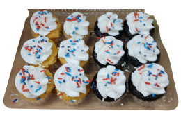
JOE'S MINI CUPCAKES VANILLA & CHOCOLATE $6.49/EA.