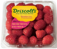
DRISCOLL'S CALIFORNIA RASPBERRIES 2/$5