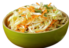
CARIBBEAN COLESLAW $5.99/LB.