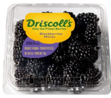
DRISCOLL'S CALIFORNIA BLACKBERRIES 2/$4