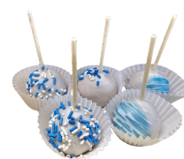
CAKE POPS ALL VARIETIES $1.99/EA.