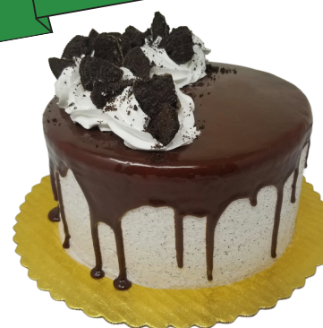
CHEF'S FEATURE OREO CAKE $32.99/6" | $47.99/8"