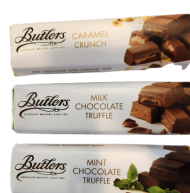
BUTLER'S CHOCOLATE BARS $3.49/EA.