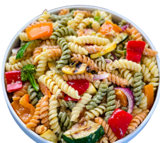
VEGETABLE ROTINI $7.99/LB.