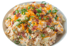
TWICE BAKED POTATO SALAD $7.99/LB.