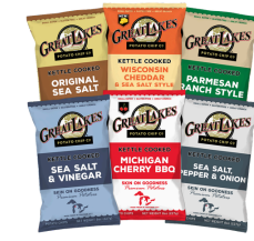
GREAT LAKES POTATO CHIPS ALL VARIETIES $3.99/EA.