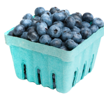
GEORGIA BLUEBERRIES 2/$6