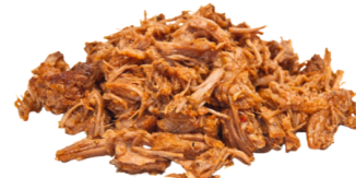
HOUSE SMOKED PULLED PORK $10.99/LB.