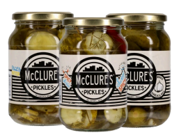
MCCLURE'S PICKLES ALL VARIETIES $3.99/EA.