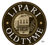
OLD TYME SWISS CHEESE $5.29/LB.