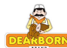
DEARBORN BRAND DEARBORN BEEF BOLOGNA $7.49/LB.