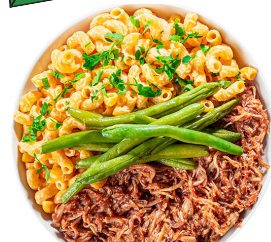
CHEF FEATURE HOUSE SMOKED DINNERS PORK/BRISKET/CHICKEN $7-9.99/LB.