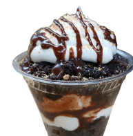
S'MORES CAKE PARFAIT $4.49/EA.