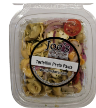
TORTELLINI PESTO SALAD $7.99/LB.