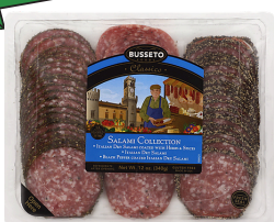
BUSSETO SALAMI COLLECTION TRAY $13.99/EA.