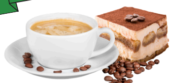
TIRAMISU COFFEE FLAVOR OF THE WEEK $11.99/LB.