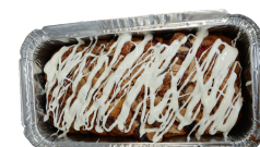
RED, WHITE & BLUE LARGE QUICKBREAD $7.49/EA.