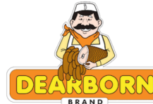
DEARBORN BRAND DEARBORN LONDON BROIL $10.99/LB.