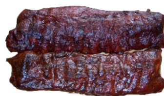
BBQ BABY BACK RIBS $15.99/LB.