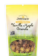
JESSICA'S GRANOLA ALL VARIETIES $6.99/EA.