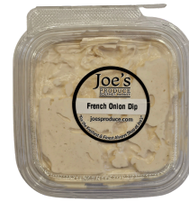
FRENCH ONION DIP $6.99/LB.