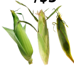
GEORGIA SWEET CORN 12/$5