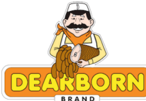
DEARBORN BRAND DEARBORN ROAST BEEF $9.99/LB.