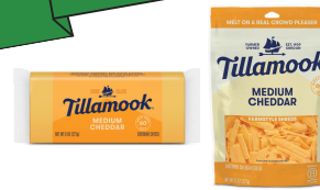
TILLAMOOK CHEESE SHREDS, SINGLES & BARS $4.79/EA.