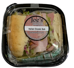
SPICY ITALIAN SUB $9.49/EA.