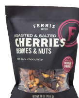
FERRIS NUT CO. FRUIT & NUT MIXES $8.99/EA.