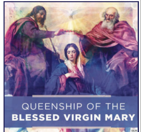
QUEENSHIP OF THE BLESSED VIRGIN MARY

We may think of queens as the spouse of the king, but there is another key relationship: the king's mother. In Biblical history, we see instances where the mother of the king is given due as a queen herself, complete with a throne! Mary's guiding influence over her Son is seen most notably in the Wedding Feast at Cana. Mary is not Queen on her own merit. She is "full of grace" and "blessed" in "all ages" because of the reign of her Son.