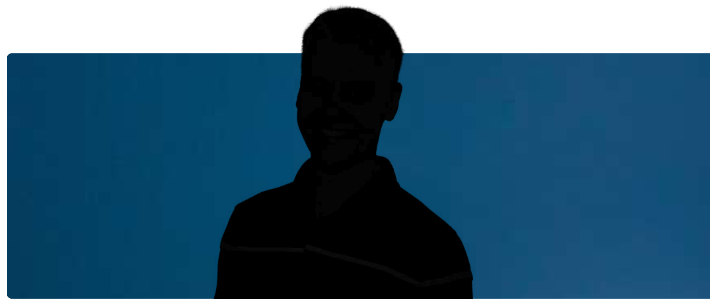
??? (Denmark) Guest Coach / Junior or Adult Camp