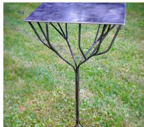
Barbie has made many tables of all shapes and sizes and styles.