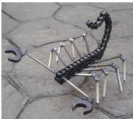
A scorpion made from odds and ends found in Barbie's shop.