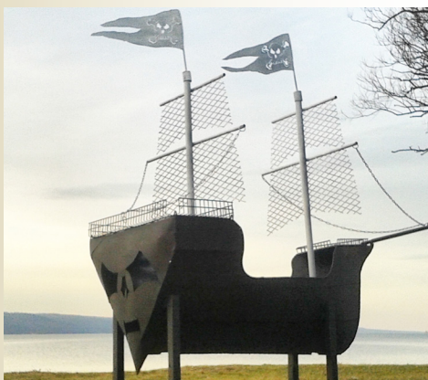
The Pirate Ship Fire Pit was a custom order. It is 7 feet tall, 7 feet long, and 34 inches wide.

ERIN'S BARBIE PARSONS HAS FANS ALL OVER THE WORLD AS SHE TURNS SCRAP METAL INTO ART WITH A TORCH