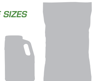
8 lb. Jug