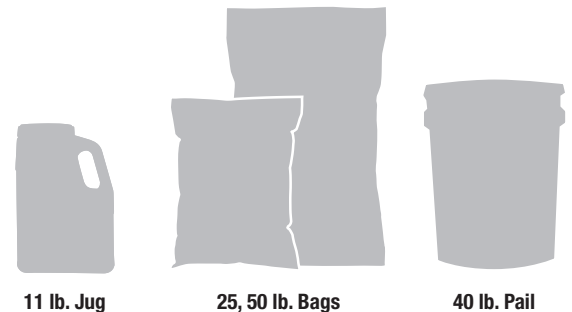
11 lb. Jug