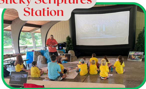
Sticky Scriptures Station