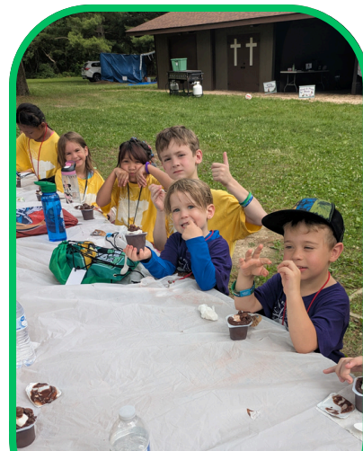
Tundra Treats Station