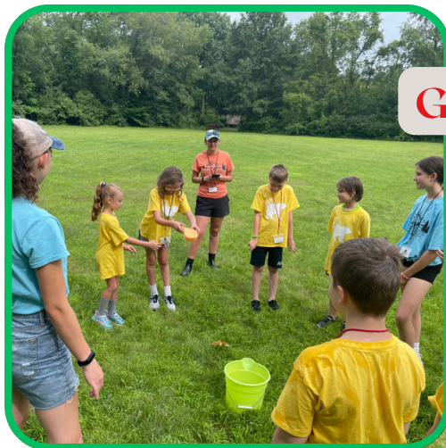
Glacier Games Station