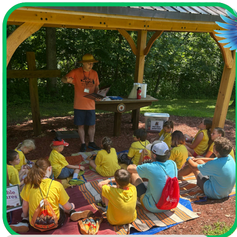
Bible Adventures Station