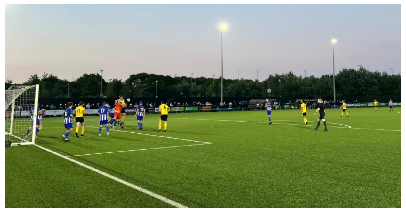
Action from Crofton Saints v Tadley Calleva Res