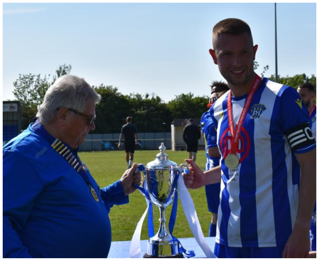
Presentation of the League Cup to Crofton