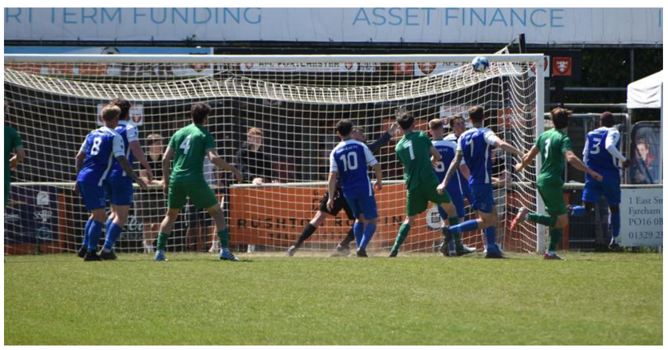
Another header from a corner for Liss Athletic v Denmead