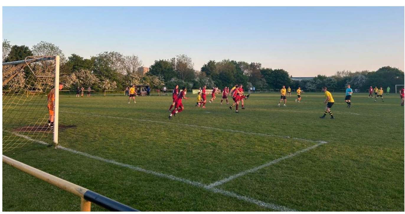
Action from QK Southampton v AFC Netley (again, with thanks to The Terrace Traveller, @TerraceTrav)