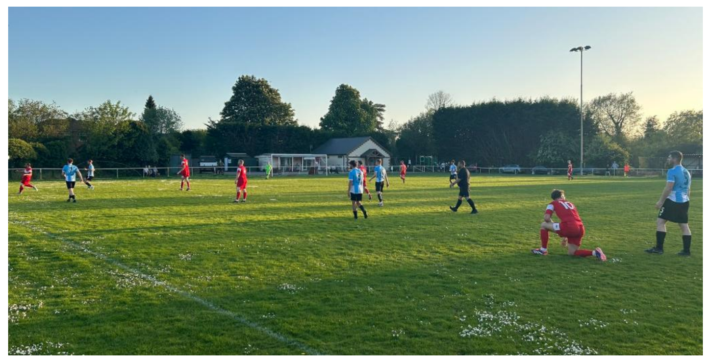
Action from Stockbridge v Whitehill & Bordon (again, with thanks to The Terrace Traveller, @TerraceTrav)