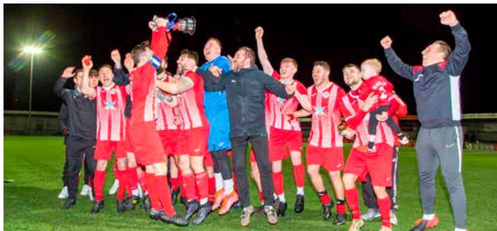
THE STALLIONS CELEBRATE WINNING THE HAMPSHIRE TROPHY, FOLLOWING THEIR 2-1 VICTORY OVER THAMES VALLEY PREMIER DIVISION CHAMPIONS, YATELEY UNITED AT HAVANT & WATERLOOVILLE.