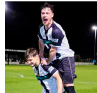
BEMERTON HEATH HARLEQUINS CELEBRATING FOLLOWING THEIR 3-0 VICTORY OVER AFC PORTCHESTER IN THE FINAL GAME OF THE SEASON WHICH SECURED RUNNERS-UP SPOT IN THE PREMIER DIVISION - AND PROMOTION TO THE SOUTHERN LEAGUE VIA PPG - FOR THE WILTSHIRE SIDE

At the other end of the table, Pagham's first season in the