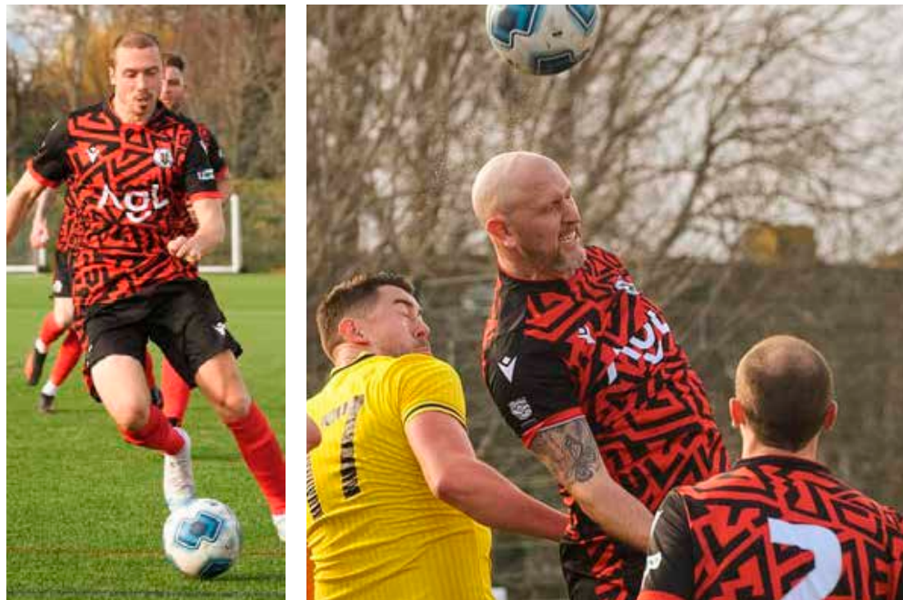
IMAGES FROM LOCKS HEATH (IN RED & BLACK) AGAINST HARVEST EARLIER THIS SEASON.