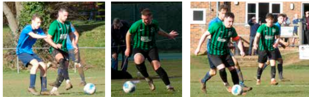
IMAGES FROM ANDOVER NEW STREET'S GAME AT LISS ATHLETIC EARLIER THIS SEASON.