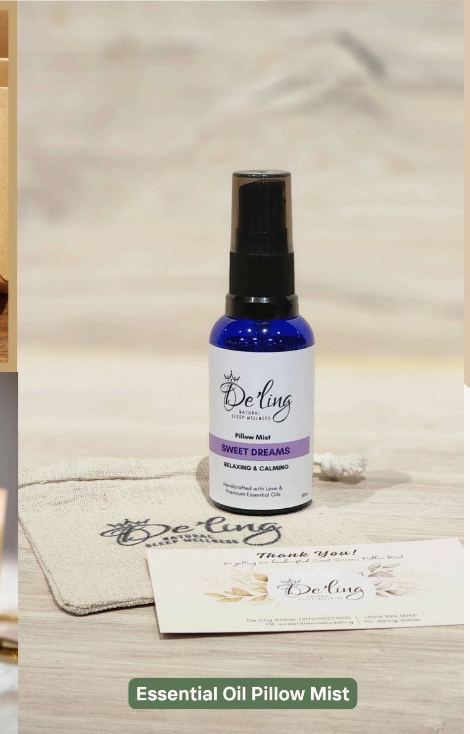
Essential Oil Pillow Mist