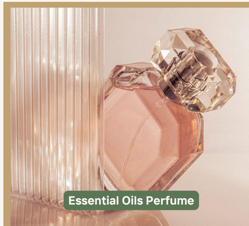
Essential Oils Perfume