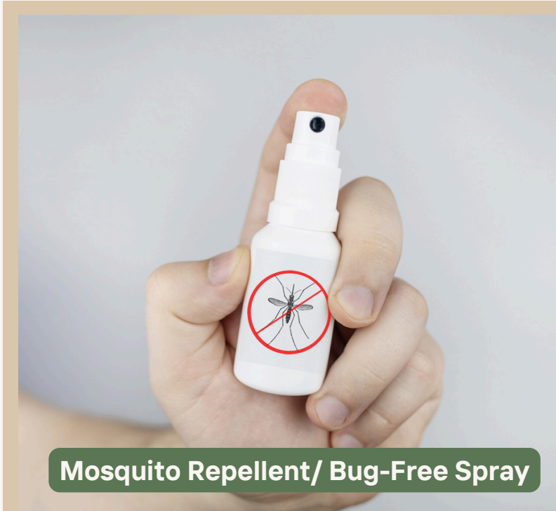
Mosquito Repellent/ Bug-Free Spray

Collection for Merchandise & In-Hotel Items