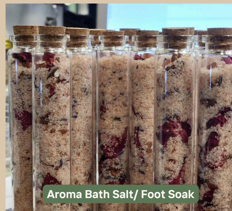
Aroma Bath Salt/ Foot Soak

Collection for Merchandise & In-Hotel Items