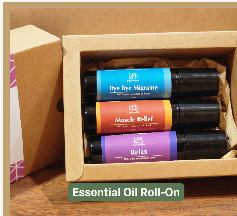
Essential Oil Roll-On