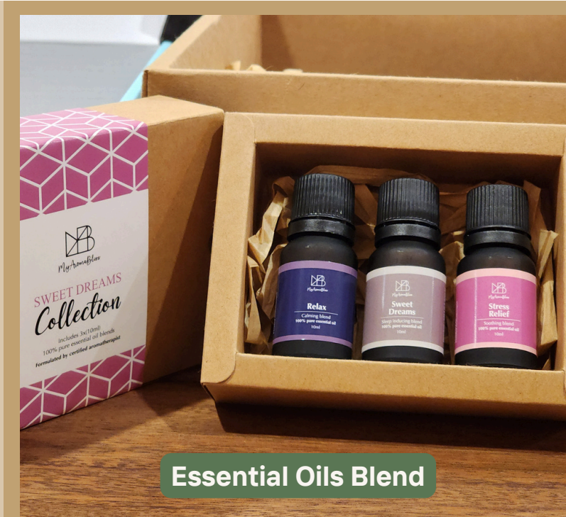
Essential Oils Blend