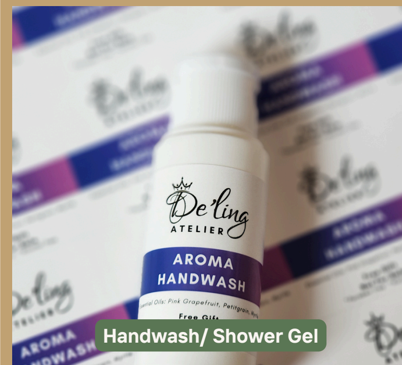
Handwash/ Shower Gel