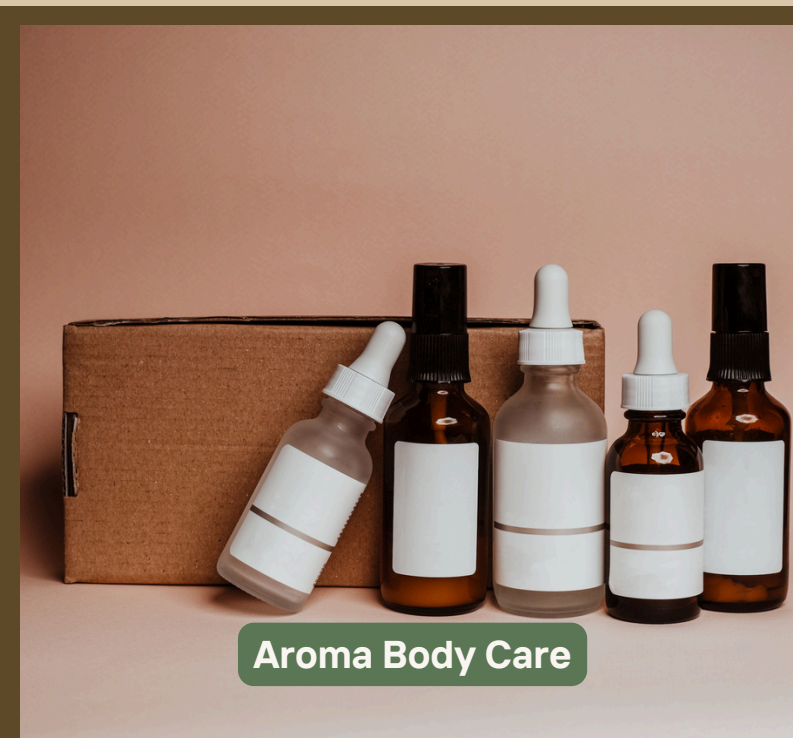
Aroma Body Care