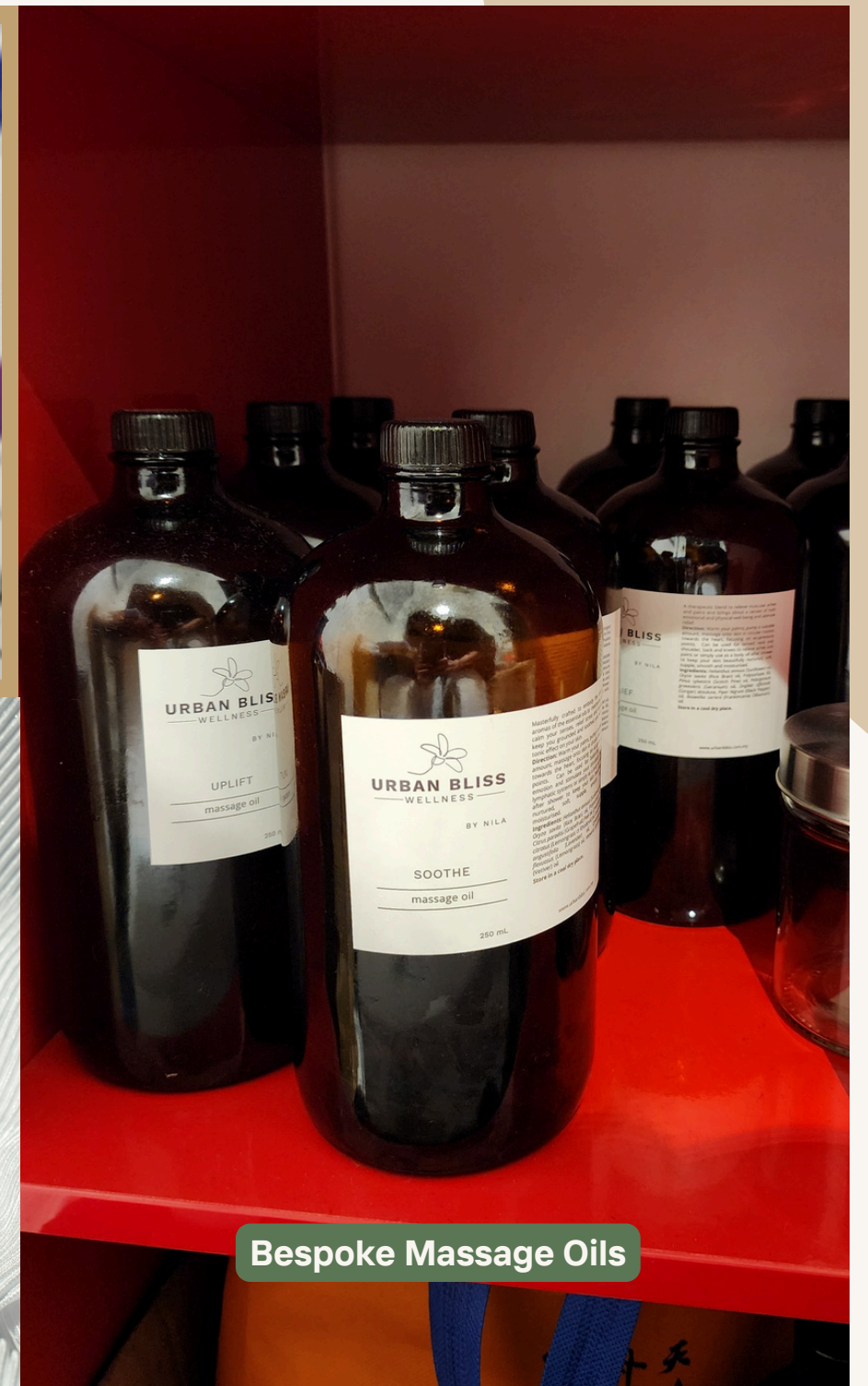
Bespoke Massage Oils