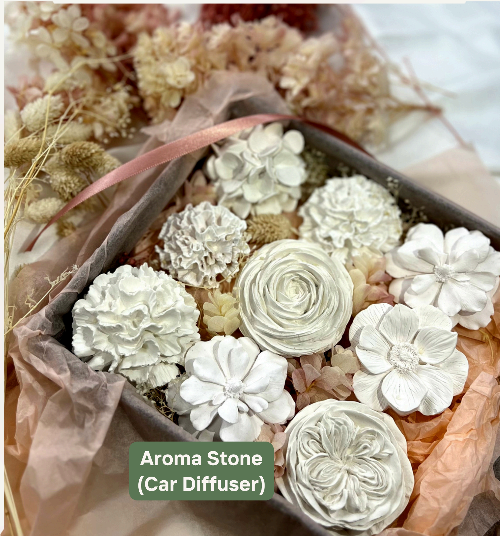
Aroma Stone (Car Diffuser)