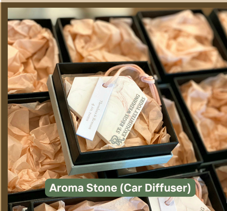
Aroma Stone (Car Diffuser)