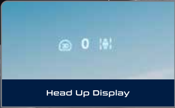
Head Up Display