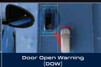
Door Open Warning (DOW)