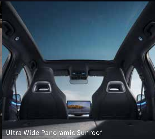
Ultra Wide Panoramic Sunroof