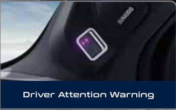
Driver Attention Warning