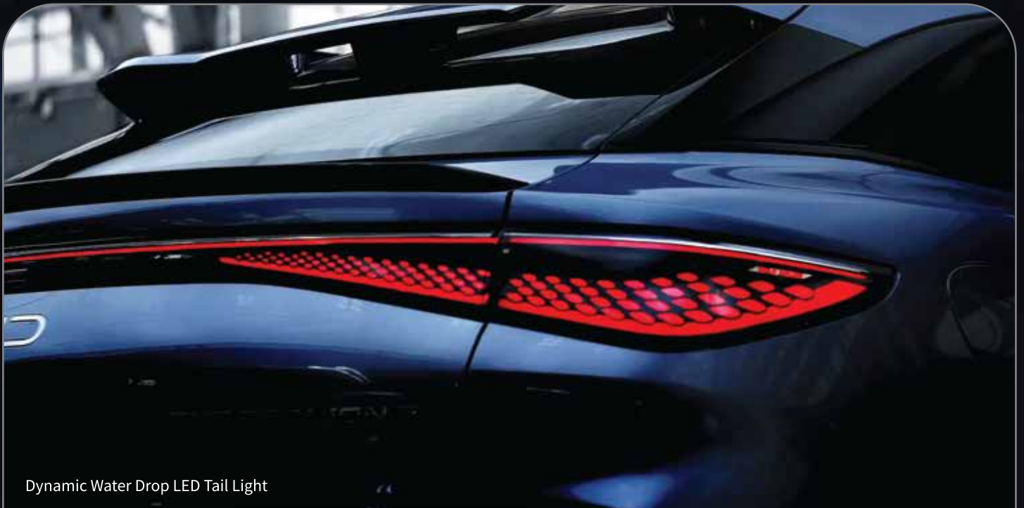
Dynamic Water Drop LED Tail Light