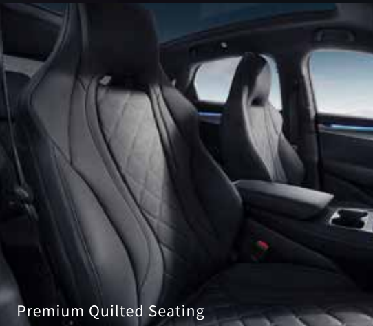
Premium Quilted Seating

BYD SEALION 7 embodies a bold vision of electric mobility with its sleek lines and commanding stance. Every detail, from the fluid design to the thoughtfully spacious interior, is designed to elevate the driving experience. Merging cutting-edge technology with a refined sense of style, the BYD SEALION 7 delivers not just performance, but an unmatched journey that redefines what an electric SUV can be.