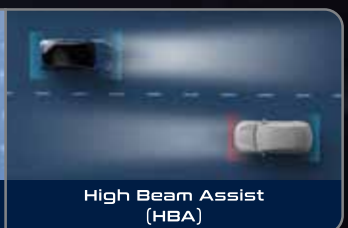
High Beam Assist (HBA)

BYD ADAS (Advanced Driver Assistance Systems) is a sophisticated suite of safety technologies utilizing advanced sensors and intelligent algorithms to enhance driver awareness and mitigate risks on the road.