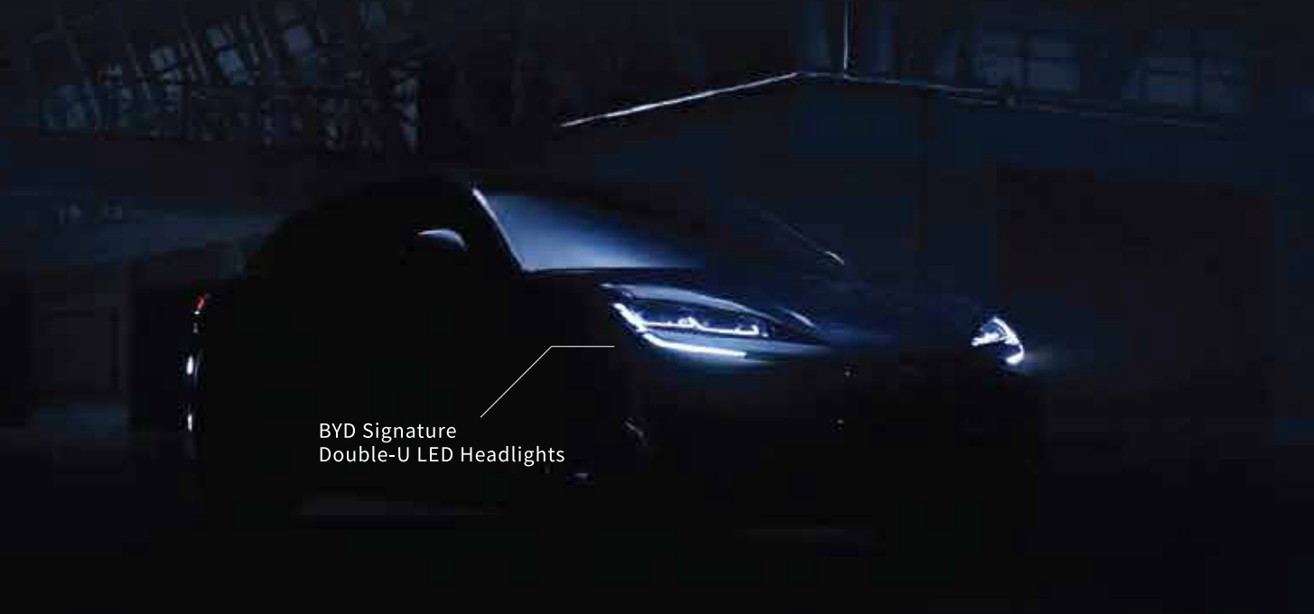
BYD Signature Double-U LED Headlights