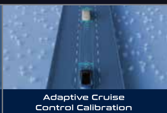
Adaptive Cruise Control Calibration