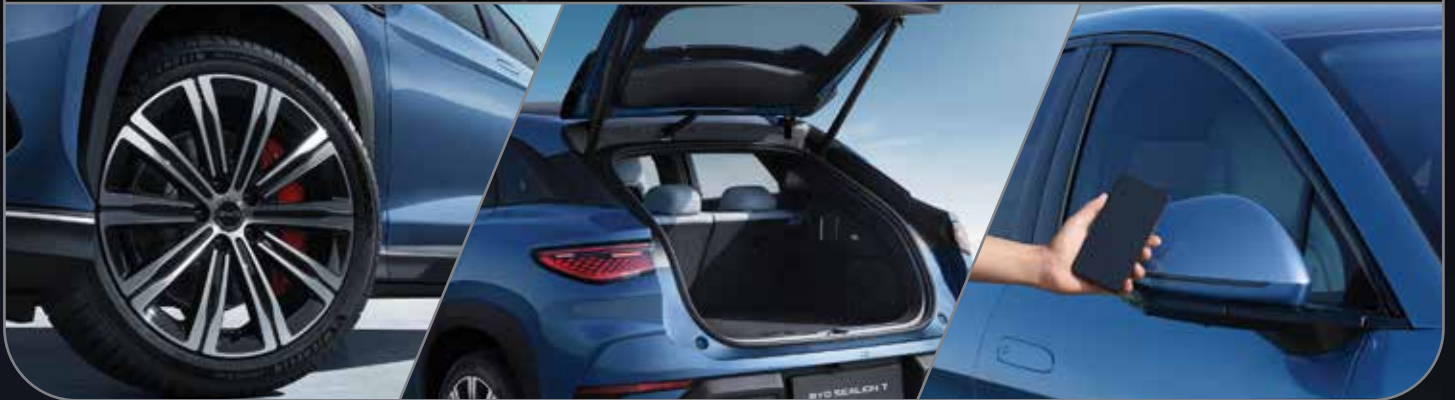
19-Inch Alloy Wheels