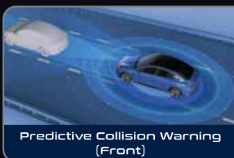
Predictive Collision Warning (Front)