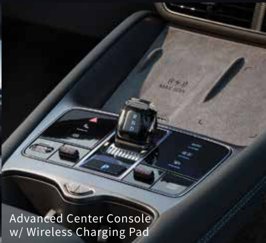
Advanced Center Console w/ Wireless Charging Pad