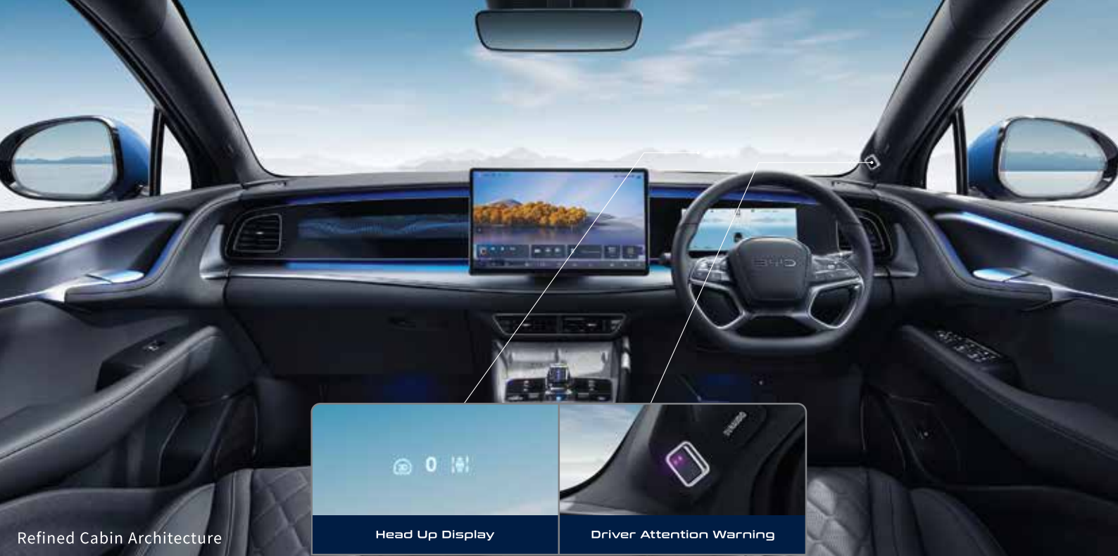
Refined Cabin Architecture