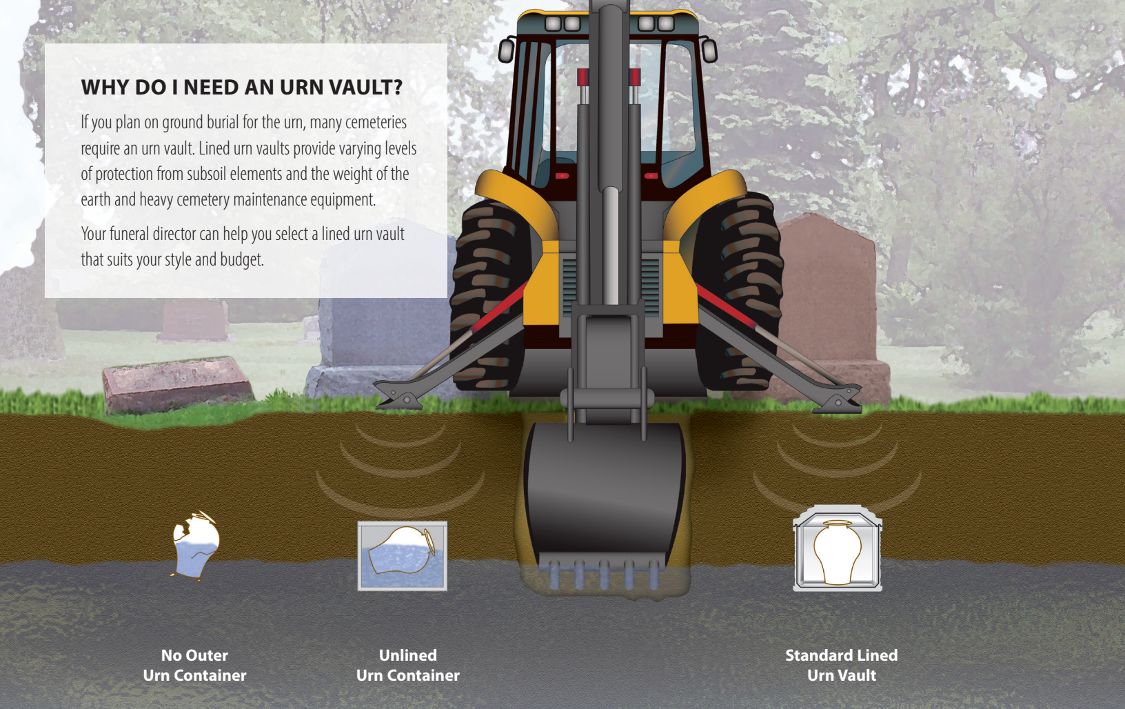
No Outer Urn Container

Your funeral director can help you select a lined urn vault that suits your style and budget.