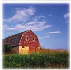
BARN Legacy 2