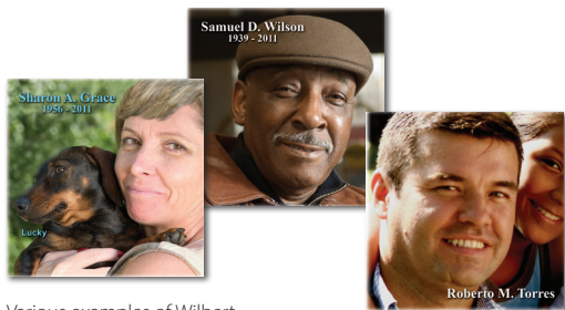
Various examples of Wilbert Custom Legacy Series prints

Just like pages from a photo album, you can choose cherished images to create a special print to honor your loved one's life.