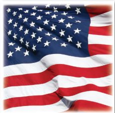
US FLAG Legacy 2