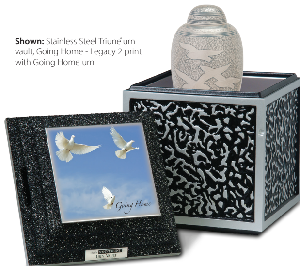
Shown: Stainless Steel Triune® urn vault, Going Home - Legacy 2 print with Going Home urn

Images vary by region. Your funeral professional can share available selections with you.