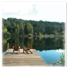
DOCK Legacy 2