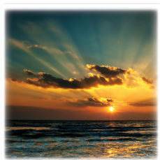
SUNRISE/SUNSET Legacy 2