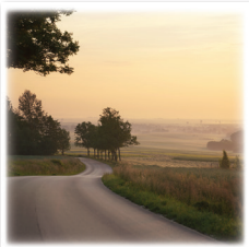
COUNTRY ROAD Legacy 2