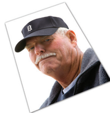
Shown: Single photograph with no background applied to Veteran Triune® urn vault

Wilbert Legacy Custom Series prints offer you the ultimate in customized personalization, with a single beloved image that you choose. Combined with or without a colored background, your loved one's essence is conveyed and displayed on the urn vault cover.