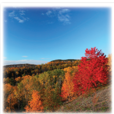
AUTUMN LAKE Legacy 2

Wilbert Legacy Series prints offer an exclusive method of personalization. Applied to the cover of Triune® series or Venetian® urn vaults, images create the illusion of being printed directly on the cover. Each scene blends into the metal or plastic with varying effects.