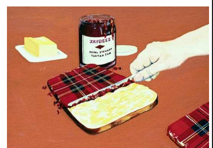
Tartan Jam Sandwich