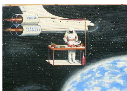
The Outdoor Caterers