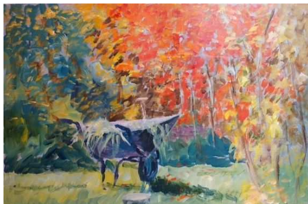
Autumn Garden by Maureen Emerton - Acrylic