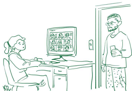
"It's my support group for Zoom Fatigue Syndrome."