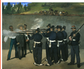
The Execution of Emperor Maximilian 1868 Eduard Manet