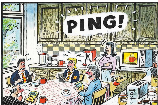
'False alarm, everyone - that WAS the microwave'

Deadline for the September issue of BArts' Broadsheet No. 15 will be August 27th