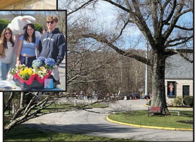
Egg Hunt: 2026 Thank you to the Columbiettes and Knights for the unselfish dedication they have. And thank you for all you do for the Parish.