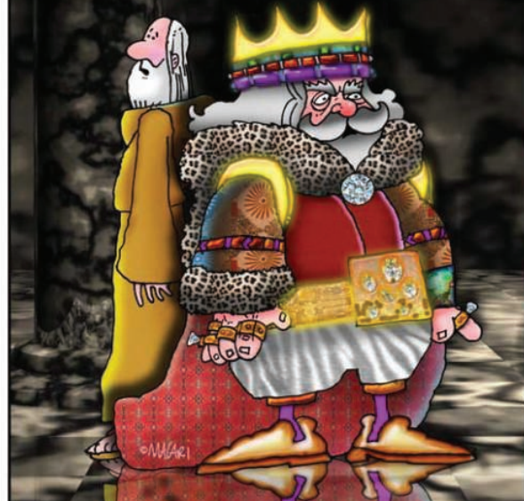
Feast Day of St. Fulgentius of Ruspe: Jan. 1

WHEN SAINT FULGENTIUS, BISHOP OF RUSPE, HEARD THEODORIC, KING OF THE GOTHs, TONGUE-LASH A GENERAL ASSEMBLY OF ROMAN NOBLES, AND BEHELD THEIR SPLENDOR, HE EXCLAIMED, "O GOD, HOW GLORIOUS MUST THY HEAVENLY JERUSALEM BE, IF EVEN EARTHLY ROME BE THUS!" AND IF THIS WORLD CAN AFFORD SO MUCH GRATIFICATION TO MERE EARTHLY LOVERS OF VANITY, WHAT MUST THERE BE IN STORE HEREAFTER FOR THOSE WHO LOVE THE TRUTH? *