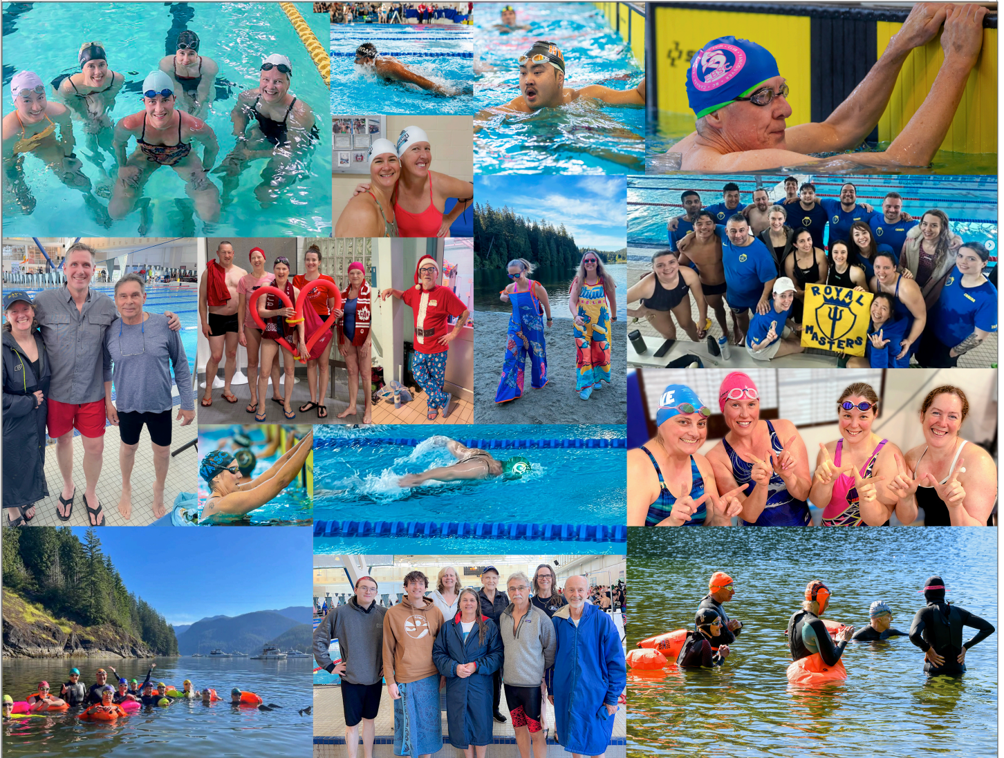
Some of our MSABC Monthly Challenge Participants 2025-26: Chilliwack, Nanaimo, Salmon Arm, Hyack, Vic Masters, Wave, Ravensong, Coast, North Shore, Royal, English Bay, Legacy, Langley Olympians, and Westshore Masters.