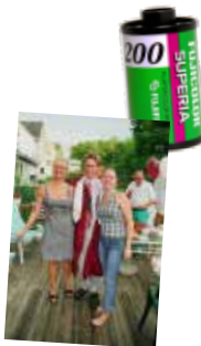
Develop and print price