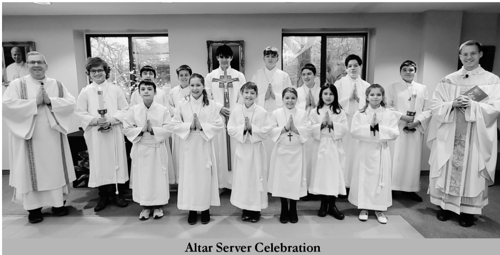
Altar Server Celebration

Volunteers assist the assembly during Mass by seating, facilitating the collection, helping maintain a prayerful and safe environment, and handing out bulletins and other materials. Through their attentive service, they help ensure that worship proceeds smoothly and reverently. They are scheduled based on their availability each week and for special liturgies at SH & DM. Charisms: Helps, Hospitality, & Service.