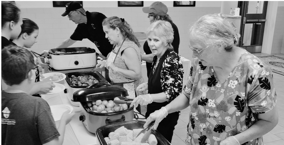
Totus Tuus Summer Youth Program

Faithful and active disciples gather with residents at Buckley Landing every Wednesday to pray the Most Holy Rosary, offering meditation on the mysteries of faith, peace, and companionship. They are scheduled based on their availability. Charisms: Encouragement, Healing, Intercessory Prayer, & Mercy.