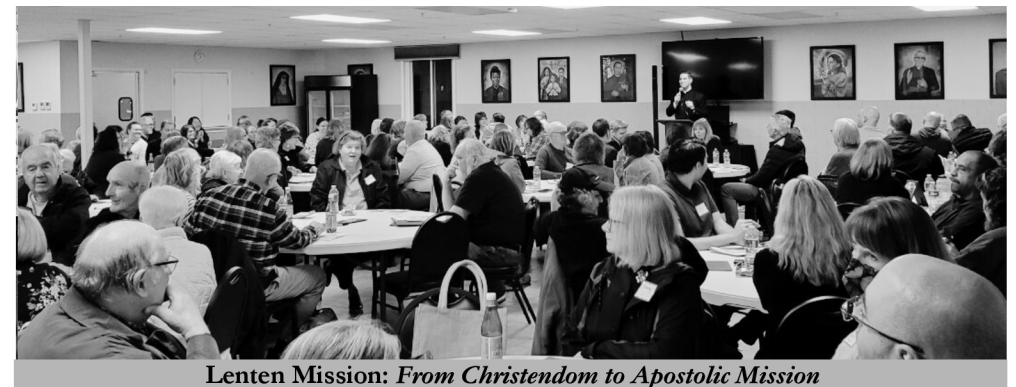
Lenten Mission: From Christendom to Apostolic Mission

Faithful and active disciples guide young people as they prepare to receive the Sacrament of Confirmation. They lead regular sessions to help candidates grow in faith and understanding, equipping them to live the Christian life. They meet weekly during the school year and at other times to prepare at SH & DM. Charisms: Evangelism, Faith, Leadership, Prophecy, & Teaching.