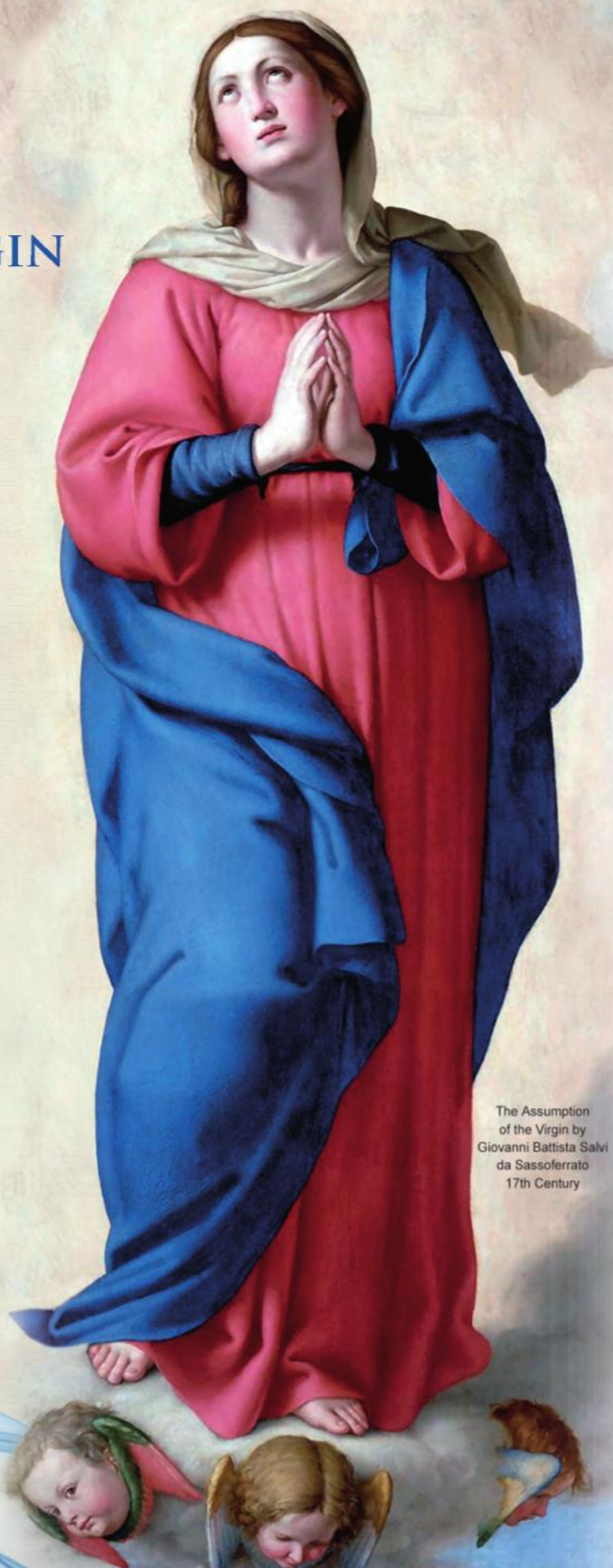
The Assumption of the Virgin by Giovanni Battista Salvi da Sassoferrato 17th Century