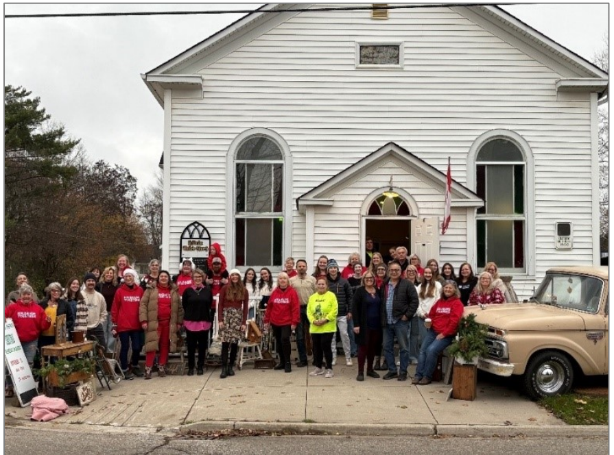
It takes a village! Kilbride Maker's Market.

On Sunday December 21 , join us for our carol sing service at 9:30 am. Yes, there will be a coffee hour afterwards!