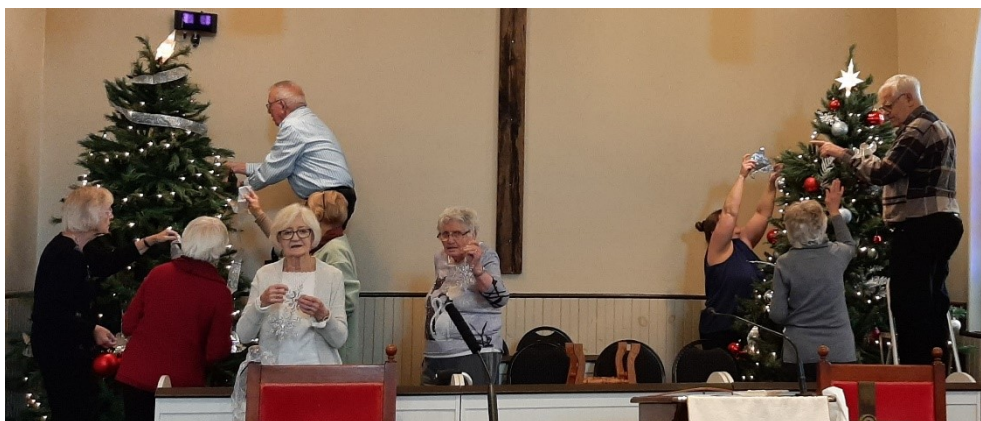
Special thanks to the faithful volunteers who put up the Christmas trees on Nov. 18.