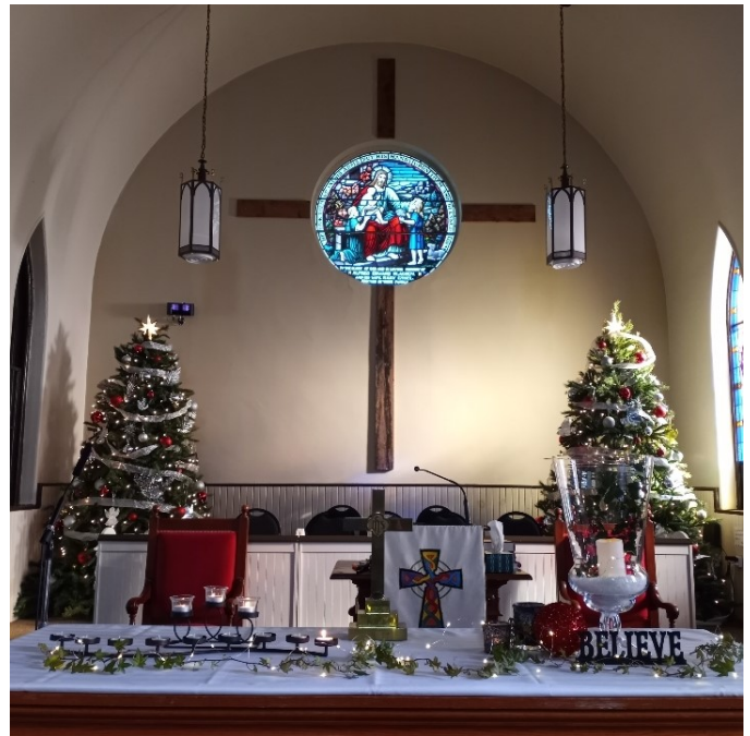
The Church Sanctuary looked particularly lovely for the "Refreshment & Reflection" hospitality centre at the Christmas Bazaar. The sun through the stained-glass windows was a wonderful treat for many who visited.