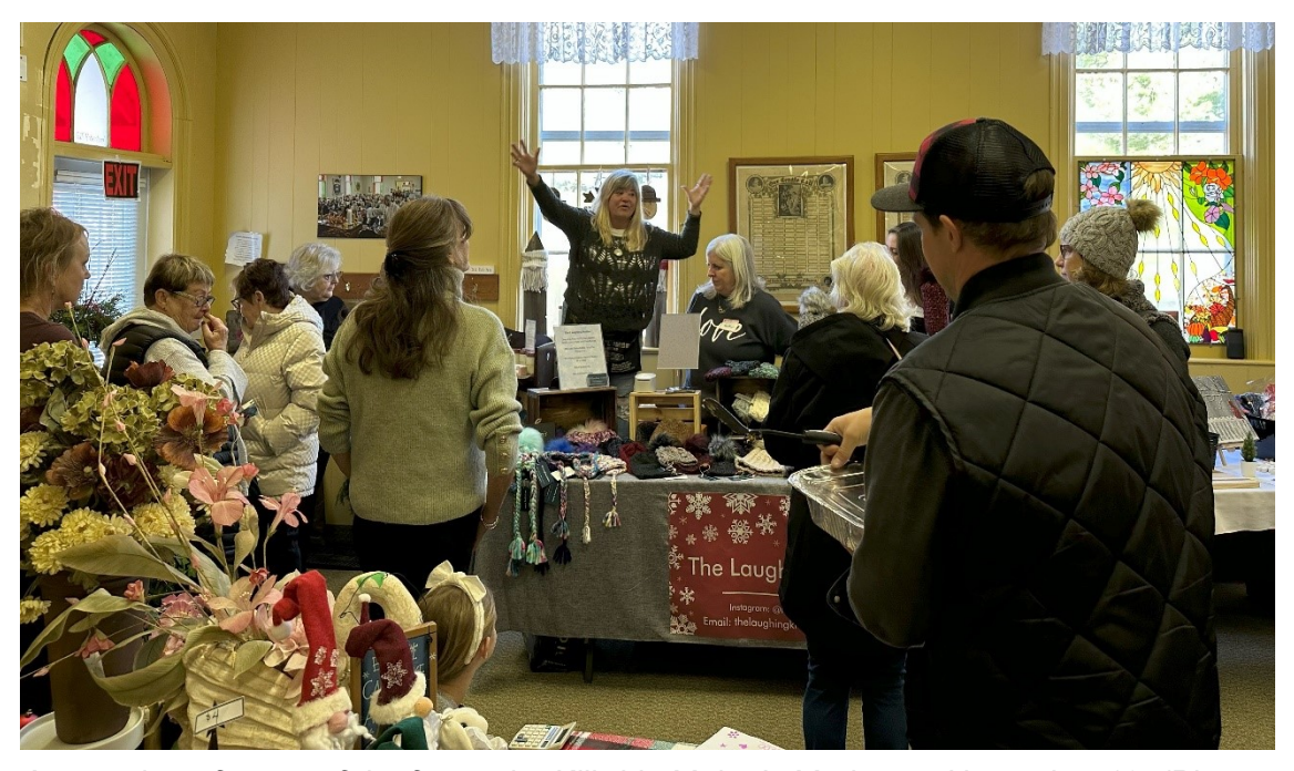
A snapshot of some of the fun at the Kilbride Maker's Market on November 18.