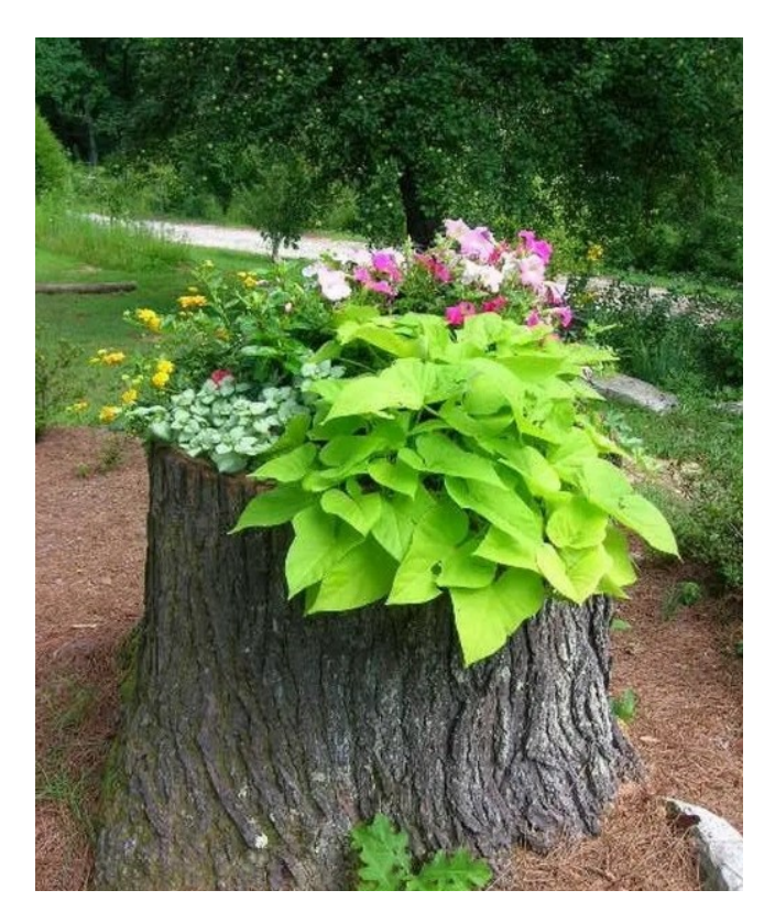
Example of a tree stump planter, similar to what is proposed for the Cemetery.