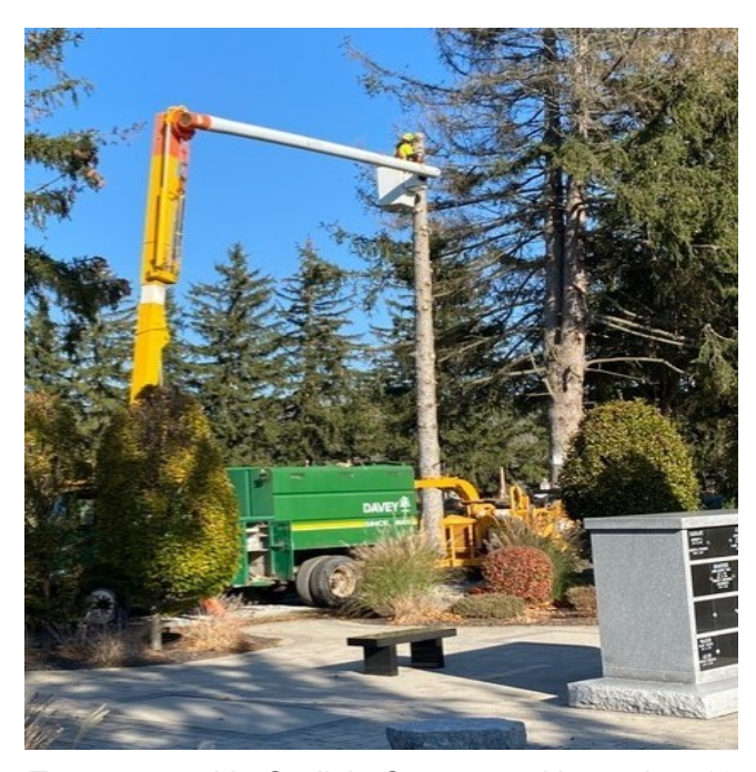
Tree removal in Carlisle Cemetery, November 13, 2023.

The date for the next paper shredding event is set already! Please mark your calendars for Saturday October 19, 2024 .