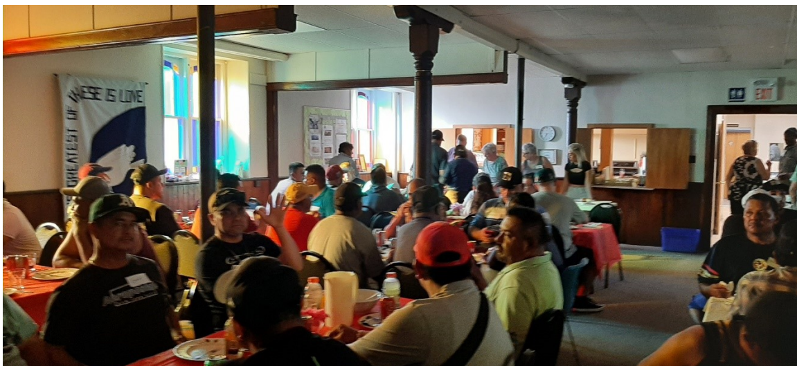
We had a very full house for last year's Migrant Workers event. Please pray for a cooler day!