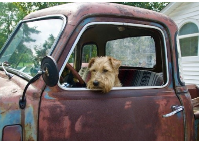
Everybody loves the vintage car show!

We're gearing up for our second annual car show on September 12 — pun intended! If you have a vintage vehicle and would like to reserve a spot, please email the church. Otherwise, come enjoy a BBQ, bake sale and some really cool vehicles. We hope to welcome the vintage firetrucks back again this year.