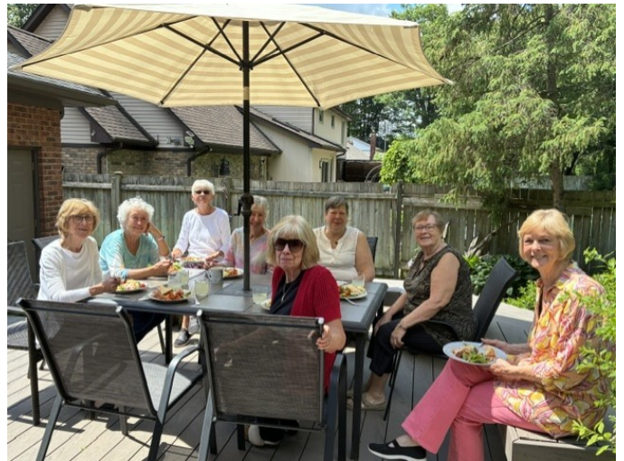
UCW members and friends enjoyed a mid-season luncheon at Gilberts' on June 17.