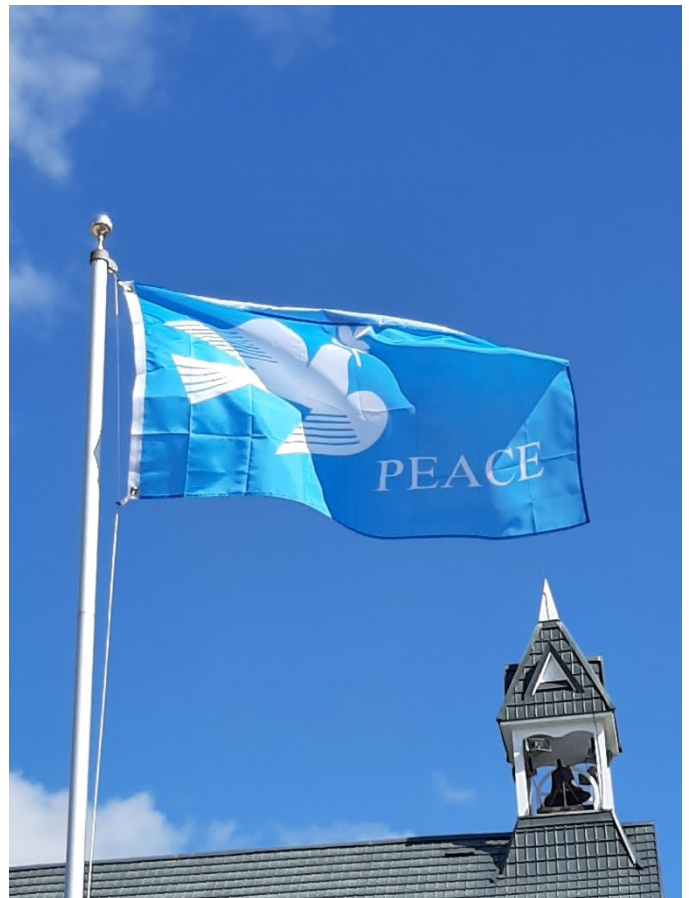
This spring we flew our new Peace flag for all the world to see. May it be so.

All that is asked is a free-will donation to Carlisle United Church.