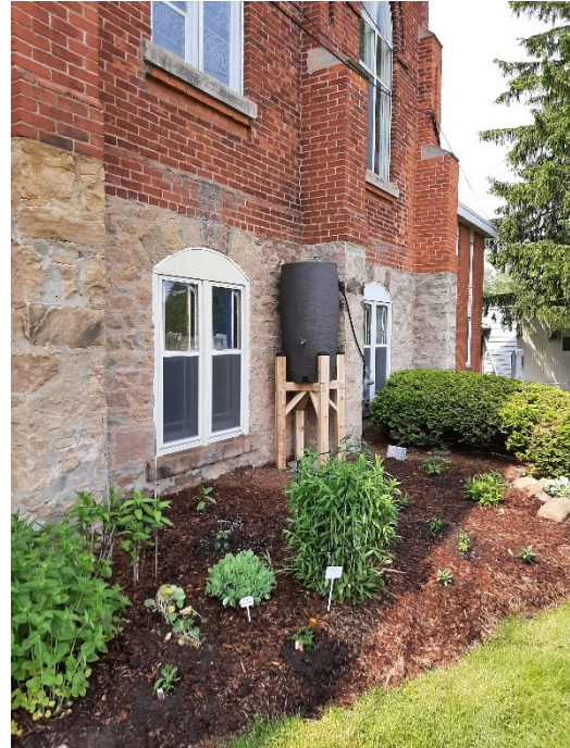
New rain barrel irrigation system installed in the Carlisle Butterfly Habitat.