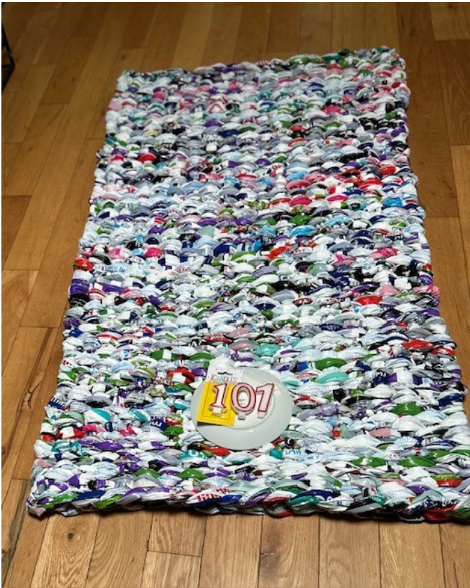
Mat 101.

Mat number one hundred and one is finished and when I have 5 or more together, my friend might pick them up and take them to Canadian Food for Children and the many people who are in need of them. As you can see, many colours of different bags have come together. Thank you very much for doing your part in keeping the bags out of the landfill sites. I have received bags from all over Ontario, e.g. Meaford, Huntsville, Carlisle and Grimsby. As I have said before, many thanks to everyone that's supporting this project.