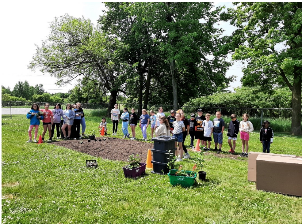
Balaclava students proudly show off their new butterfly garden on the school grounds.