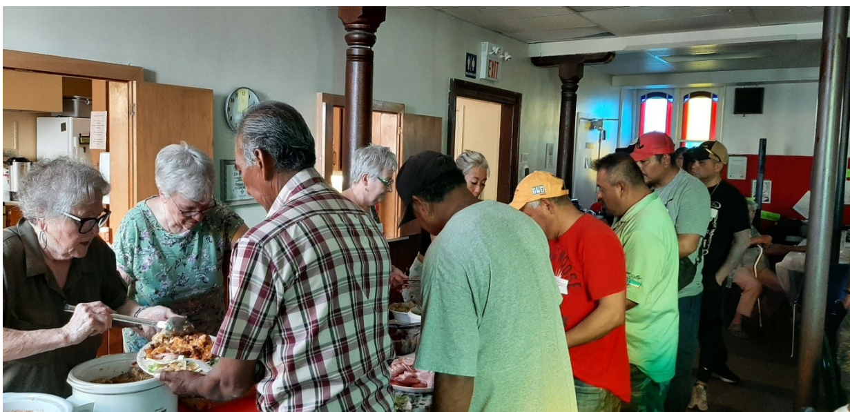
Guests and volunteers at the Migrant Workers welcome event on Sunday June 22.