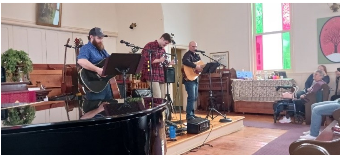
Music Sunday in Kilbride.