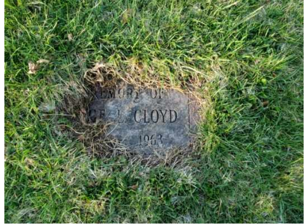
Before and after – Cloyd flat marker, Carlisle United Church Cemetery, Carlisle