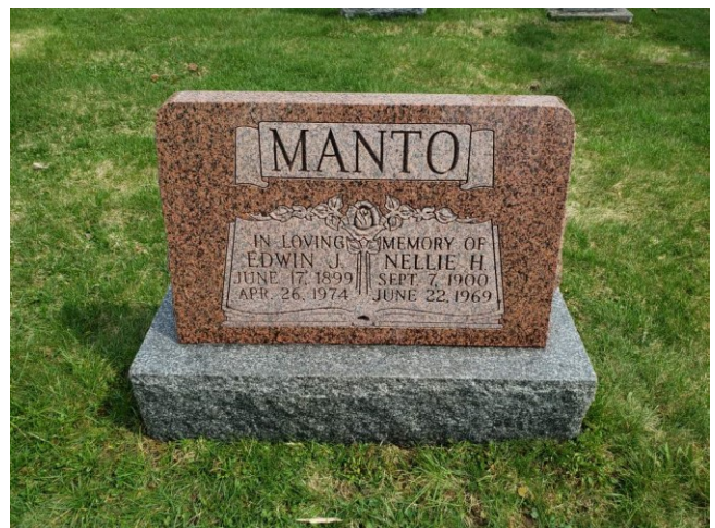
Before and after ~ Manto monument, Carlisle United Church Cemetery, Carlisle