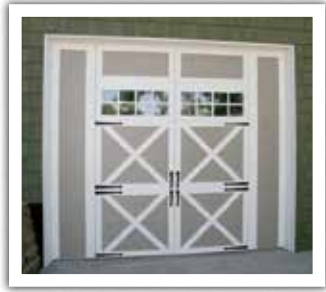
Custom Creation: Shown in Sandstone with Stockton windows