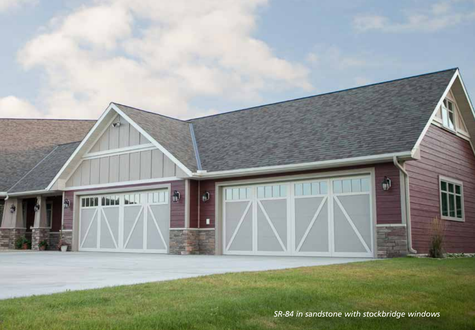
SR-84 in sandstone with stockbridge windows

With classic beauty, durability and thermal efficiency, your home will be