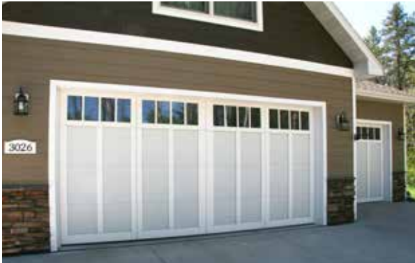
SR-82 in white with stockbridge windows