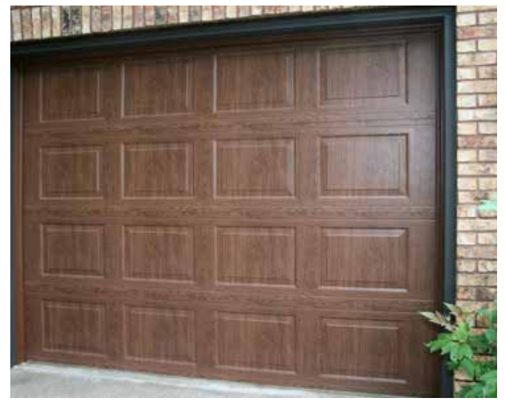
TR-138 in medium oak

The leauty & style of handcrafted wood panel doors without the high maintenance. North Central Door is pleased to offer three bidirectional woodgrain finishes, giving a realistic, luxurious look.