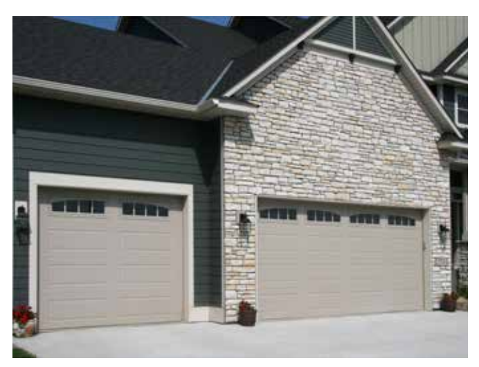
LP-138 in sandstone with wyndbridge windows