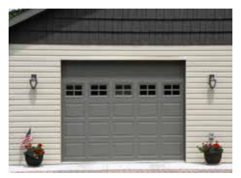
TR-II in earthtone with colonial windows

The Forest Bay collection of insulated thermal doors combines the stylish appearance of woodgrained embossment with the rugged durability of heavy gauge steel thermally bonded to dense polystyrene insulation. This collection delivers thermal efficiency available in three door thicknesses – 1 3/8, 2 & 3 inch, while offering a full range of colors and window options. Strength and beauty come together in one package tailor made to fit your tastes!