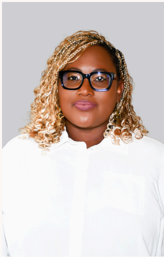
Her Health . Her Power . Her Story

And in a world that is constantly shifting, the role of a therapist becomes even more essential.