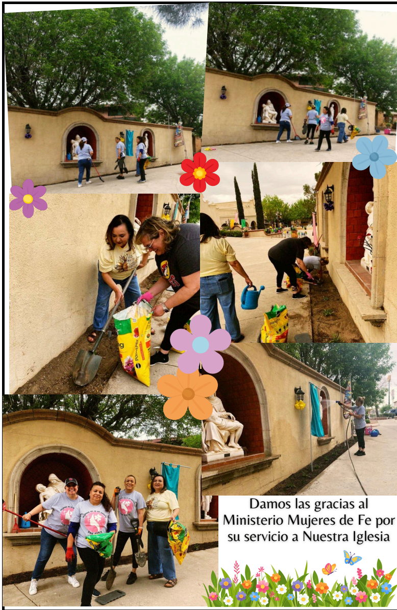
Damos las gracias al Ministerio Mujeres de Fe por su servicio a Nuestra Iglesia