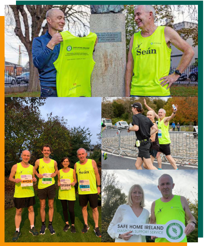
Dublin City Marathon