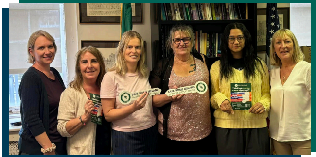
Emerald Isle Immigration Center in Woodside, New York