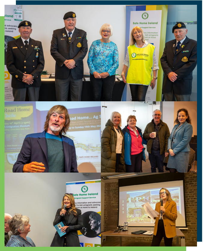
Launch of 'The Long Road Home – Ag Siúl le Chéile' at EPIC Museum