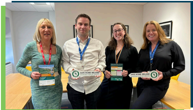
With Consular Services team at Irish Foreign Ministry Dublin

Accountability We uphold and promote the principles of good governance and integrity through transparency, effectiveness and strong leadership.