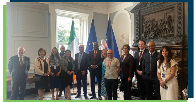
Presentation on our work to visiting delegations from Cabo Verde and Latvia in July

We had the opportunity to meet with and present on our work to visiting delegations from Cabo Verde and Latvia in July. Their respective visits to Ireland were part of fact-finding to explore models of good practice in our work with returning citizens as well as learning more about Ireland's Diaspora strategy.