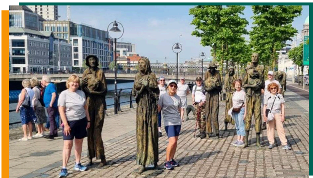
The Famine Memorial