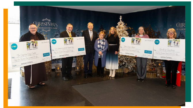
Cheque Presentation at Strokestown Park

January marked the second anniversary of Friends of Safe Home , a group who continue to play a key role in expanding our network of sponsors and collaborators, while directly supporting initiatives like our 2024 Friday Friendship Calendar, with each Friday sponsored by various individuals and companies, our Famine Way Walk and our annual concerts with our Ambassador. The printing of our Calendar continues to be sponsored by UTS Technologies.