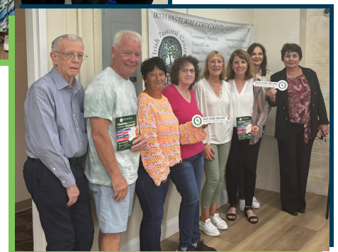
Irish Pastoral Centre, Boston