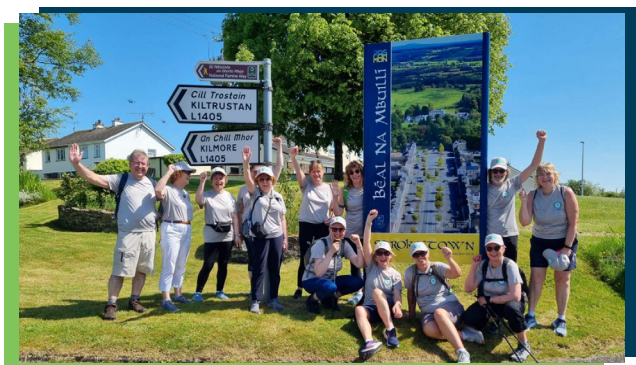
The Long Road Home - Fundraising Walk

As well as providing housing assistance, Safe Home now offers a targeted range of services to Irish emigrants abroad, regardless of age or circumstances, who wish to return to Ireland. In addition, Safe Home supports people who have returned independently, often in crisis and challenging circumstances, by providing holistic, person-centred support. For the majority, returning to Ireland was a lifelong dream that could not have been realised without the intervention and support of Safe Home.