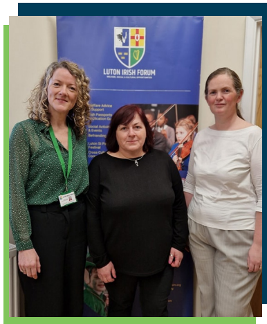
Returning to Ireland Information Clinic

We facilitated 14 Returning to Ireland Information Clinics in partnership with Irish and other welfare centres abroad, covering topics such as planned returns, moving with children, retiring in Ireland, and accessing benefits/entitlements on return. Additionally, we held virtual and in-person meetings with Irish Welfare Agencies in England, the USA, and Australia to share information, learn from each other, and make necessary cross referrals to ensure services are better informed to support their clients who are considering returning to Ireland.