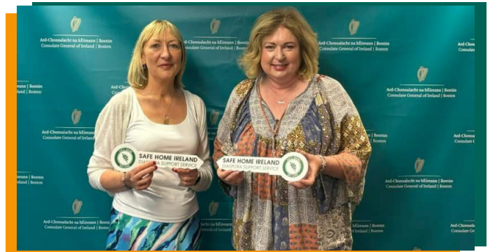
With Sighle FitzGerald, Consul General for New England, Boston