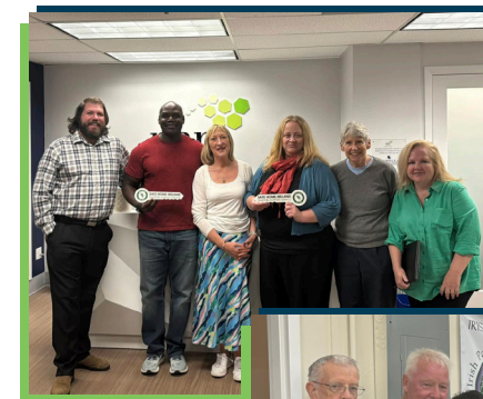
Irish Outreach & Support Services- Rian Immigrant Center in Boston