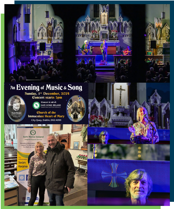
An Evening of Music & Song with Seán Keane