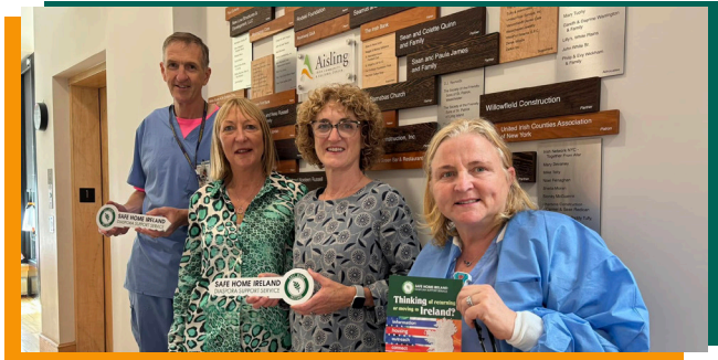
Aisling Irish Community Center, New York.