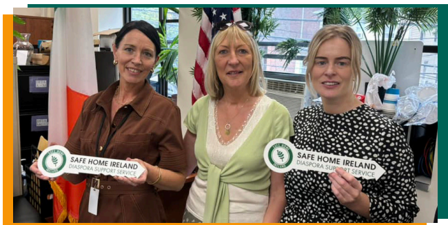
Emerald Isle Immigration Center, Bronx, New York