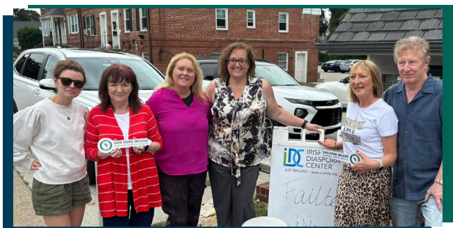
Irish Diaspora Center, Philadelphia