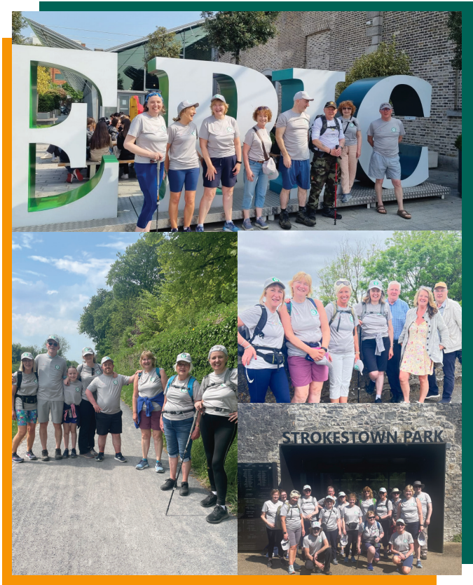
'The Long Road Home – Ag Siúl le Chéile' fundraising event