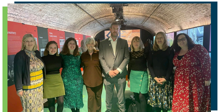
'50 years of the Irish in Britain' and to EPIC The Irish Emigration Museum

Safe Home Ireland St. Brendan's Village, Mulranny, Westport, Co. Mayo, Ireland, F28 A386