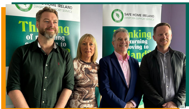
Returned Emigrants Network official launch