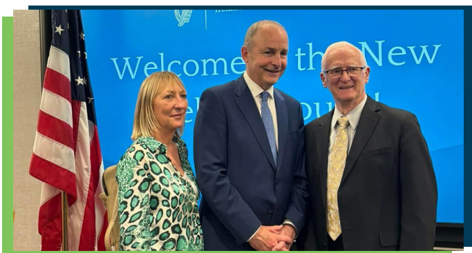
Opening of Ireland House in New York

Safe Home Ireland, St. Brendan's Village, Mulranny, Co. Mayo F28 A386