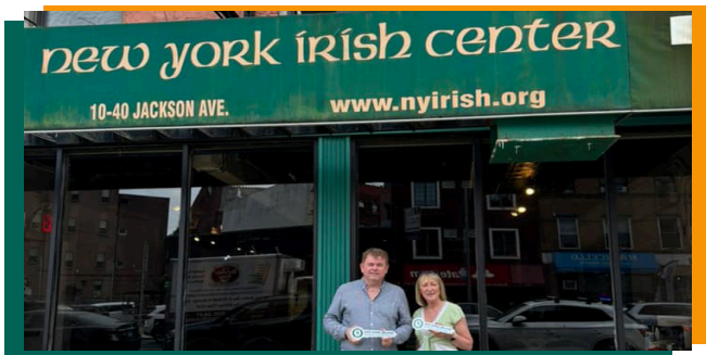
New York Irish Center